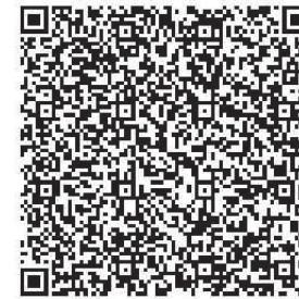
GOOGLE MAPS QR CODE