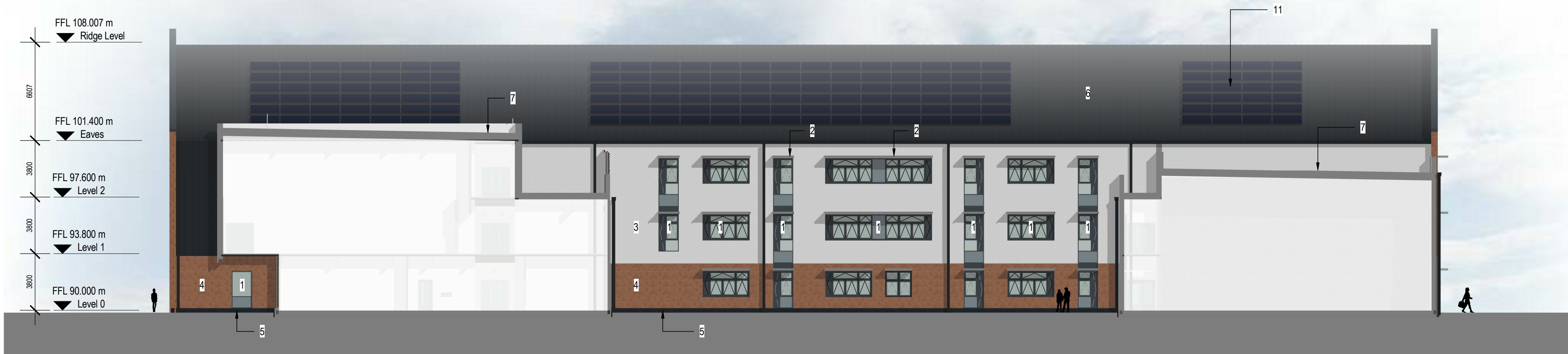
1 GA ELEVATION - COURTYARD SW. 1453 SCALE 1 : 200

Disclaimer This document is subject to the terms of the contract between Morgan Sindall Construction and Atkins. This document is issued for the party which commissioned it and for specific purposes connected with the Morgan Sindall Construction project only. It should not be relied upon by any other party, unless the contract intention is expressly stated in the contract, or used for any other purposes. We accept no responsibility for the consequences of this document being relied upon by any other party, or being used for any other purpose. This document contains confidential information and proprietary intellectual property. It should not be shown to other parties without consent from either Atkins or from the party which commissioned it, Morgan Sindall Construction