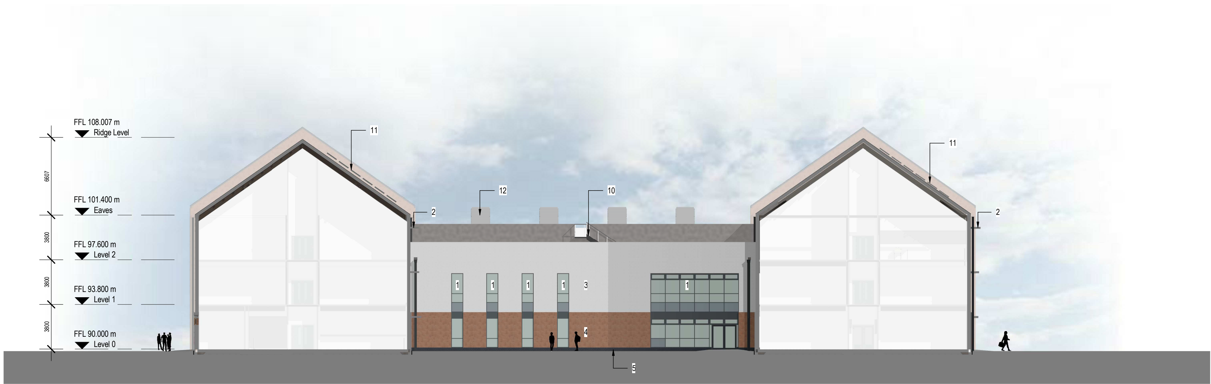
2 GA ELEVATION - COURTYARD NW. 1453 SCALE 1 : 200

Notes : 1. Drawing only to be used for the purpose for which it was created. 2. All dimensions are in millimetres unless otherwise specified.