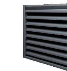
9. Louvred panel