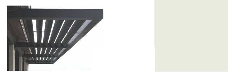
2. Brise soleil

Note: Additional vertical brise soleil to fenestration, not currently shown, may be required to limited locations