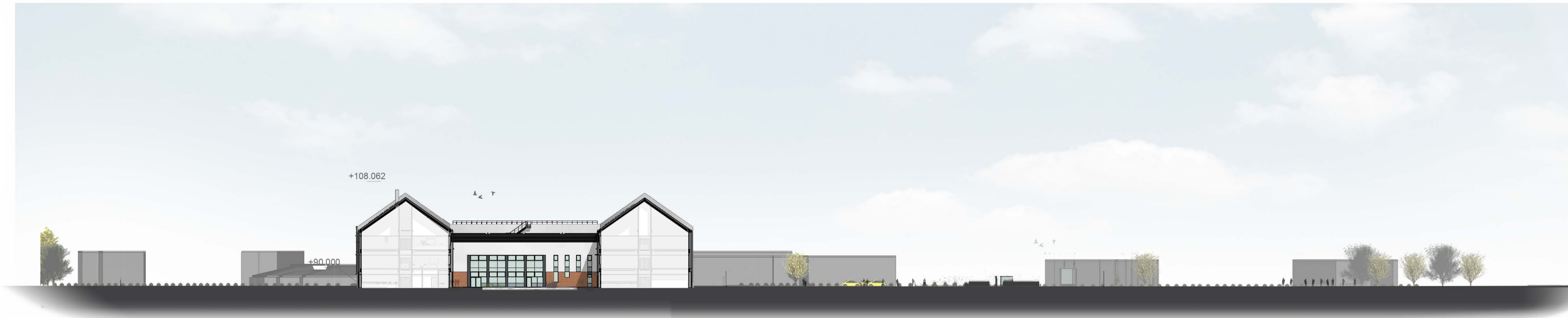
2 PROPOSED SITE SECTION SCALE 1:500