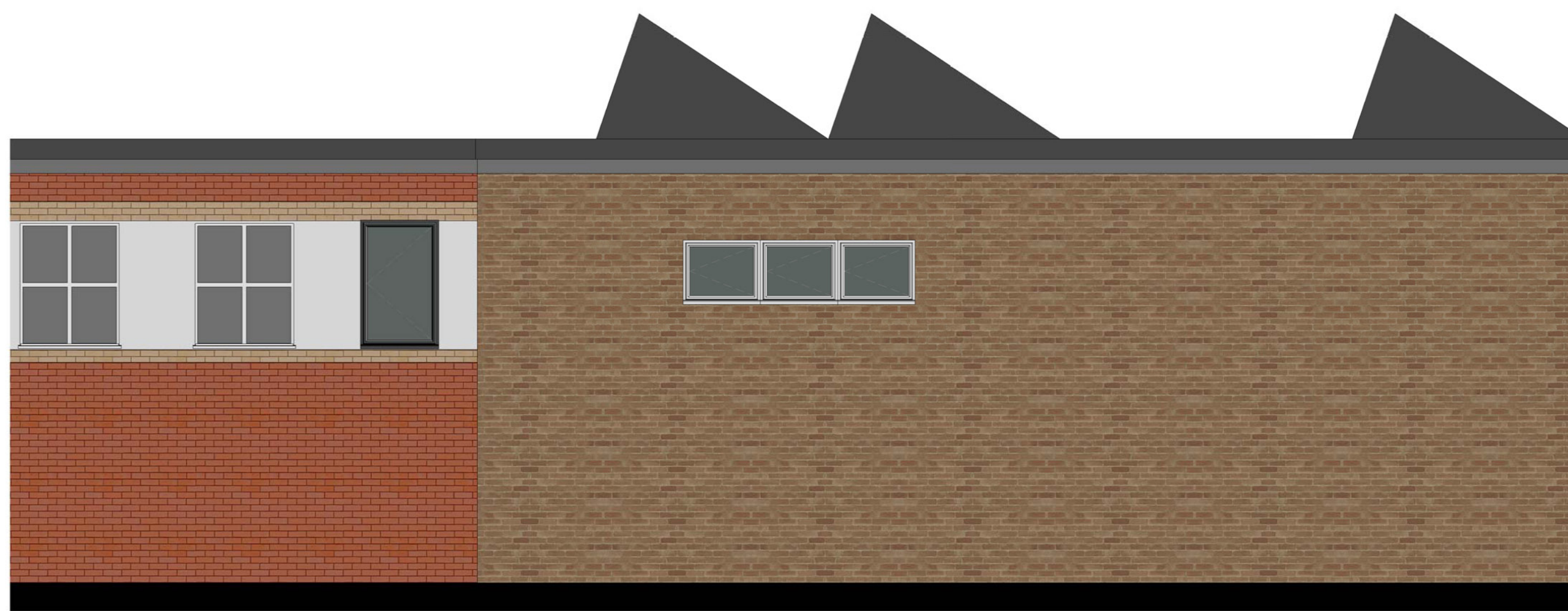
2a Existing DT Block - Existing South Elevation 1:50