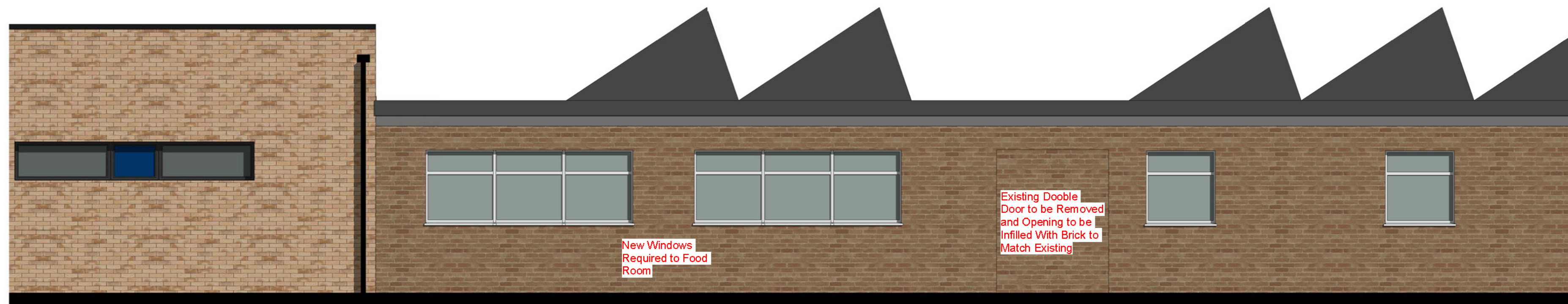
1b Existing DT Block - Proposed North Elevation 1:50