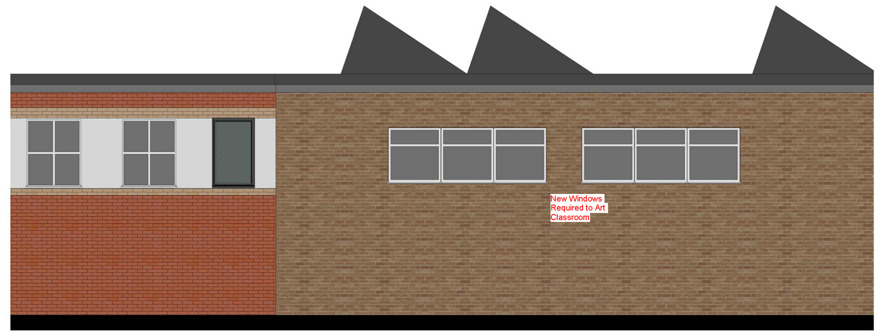
2b Existing DT Block - Proposed South Elevation 1:50