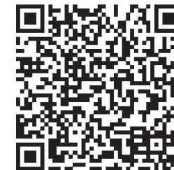
GOOGLE MAPS QR CODE

GOOGLE MAP - https://goo.gl/maps/Fw7uCHBxKxQ2