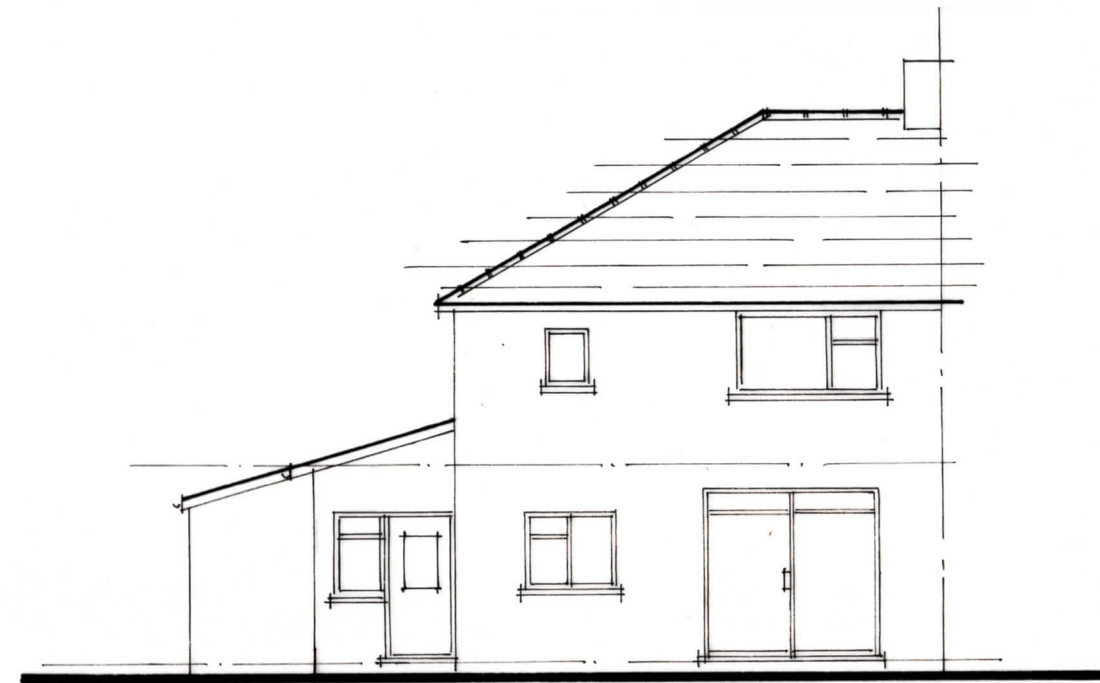
REAR ELEVATION South / West