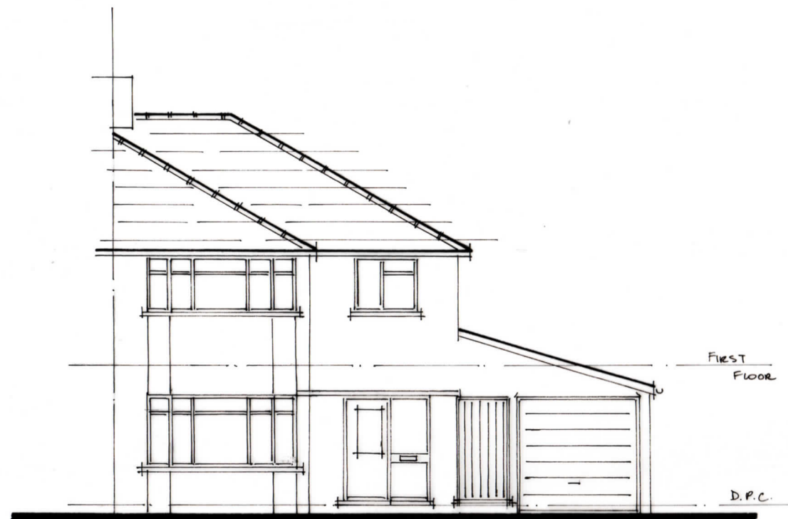
FRONT ELEVATION North / East

This drg. & the works are the copyright of AJ Design Associates and may not be amended or re-produced without written permission. No liability will be accepted for amendments made by a third pt