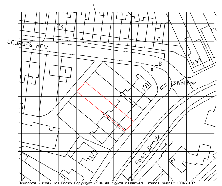
SITE LOCATION PLAN scale 1 - 1250