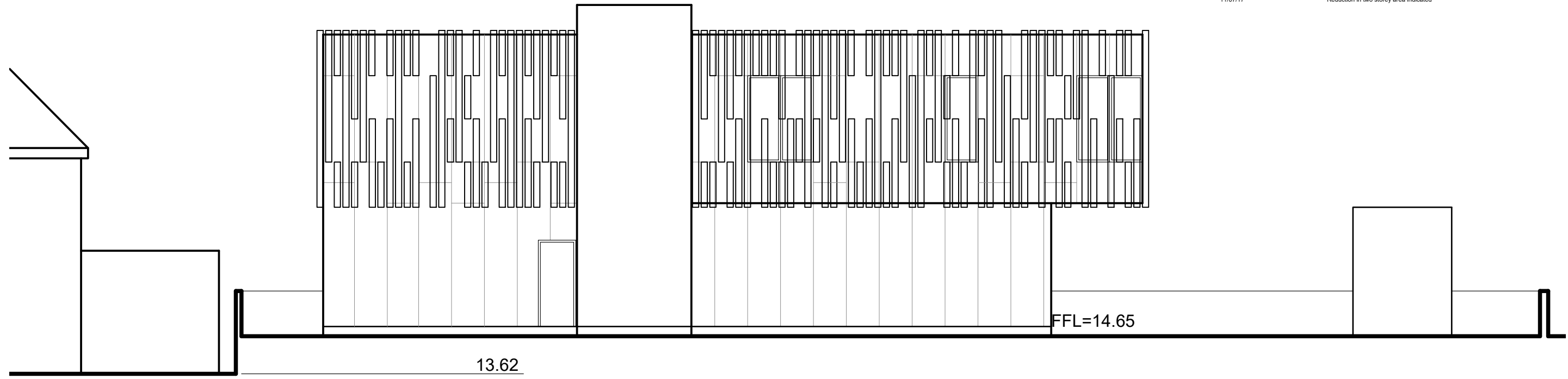
L/H SIDE ELEVATION (Orchard Crescent)