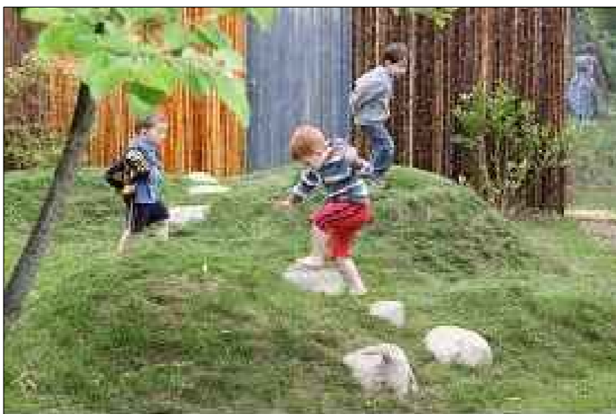
Proposed play mounds to be allowed to settle before turfing. Slopes should be no more than a gradient of 1:3