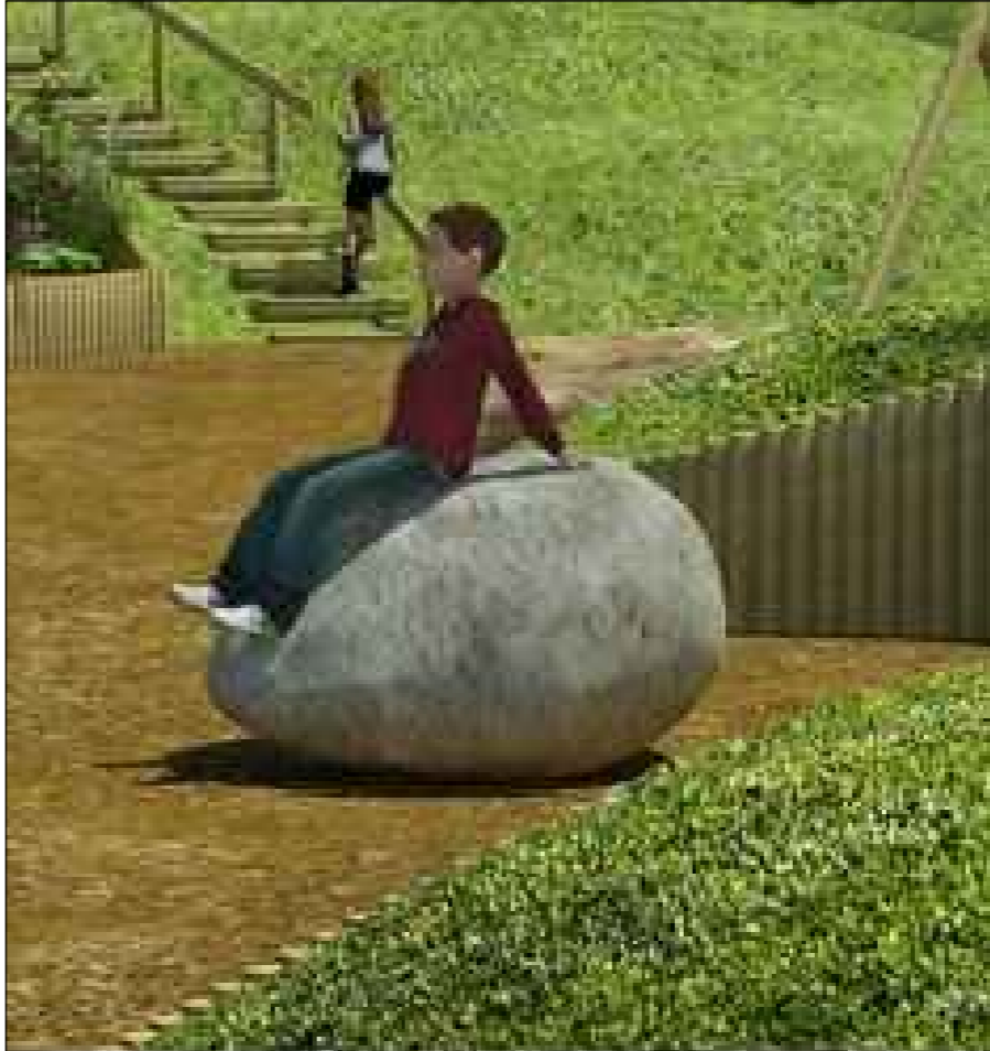
Proposed play boulders to be a mixed size of 12no. boul01-boul05 as supplied by playdale or similar