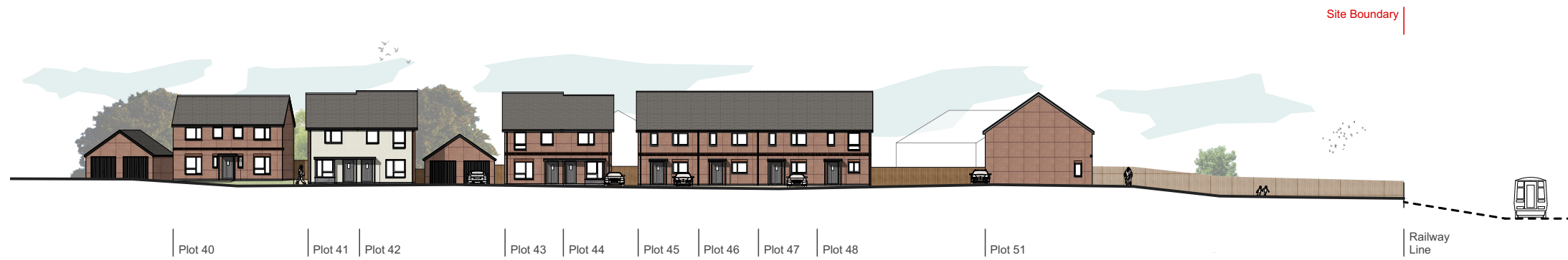
Street Scene B - B