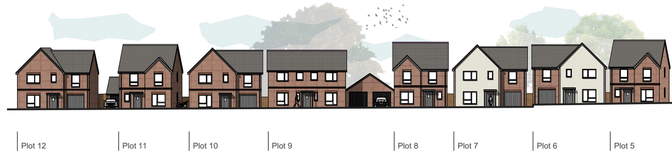
Street Scene A - A