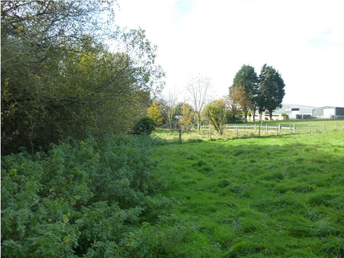
Figure 5- Froglands Farm, with Boverton Brook to Left of Photo