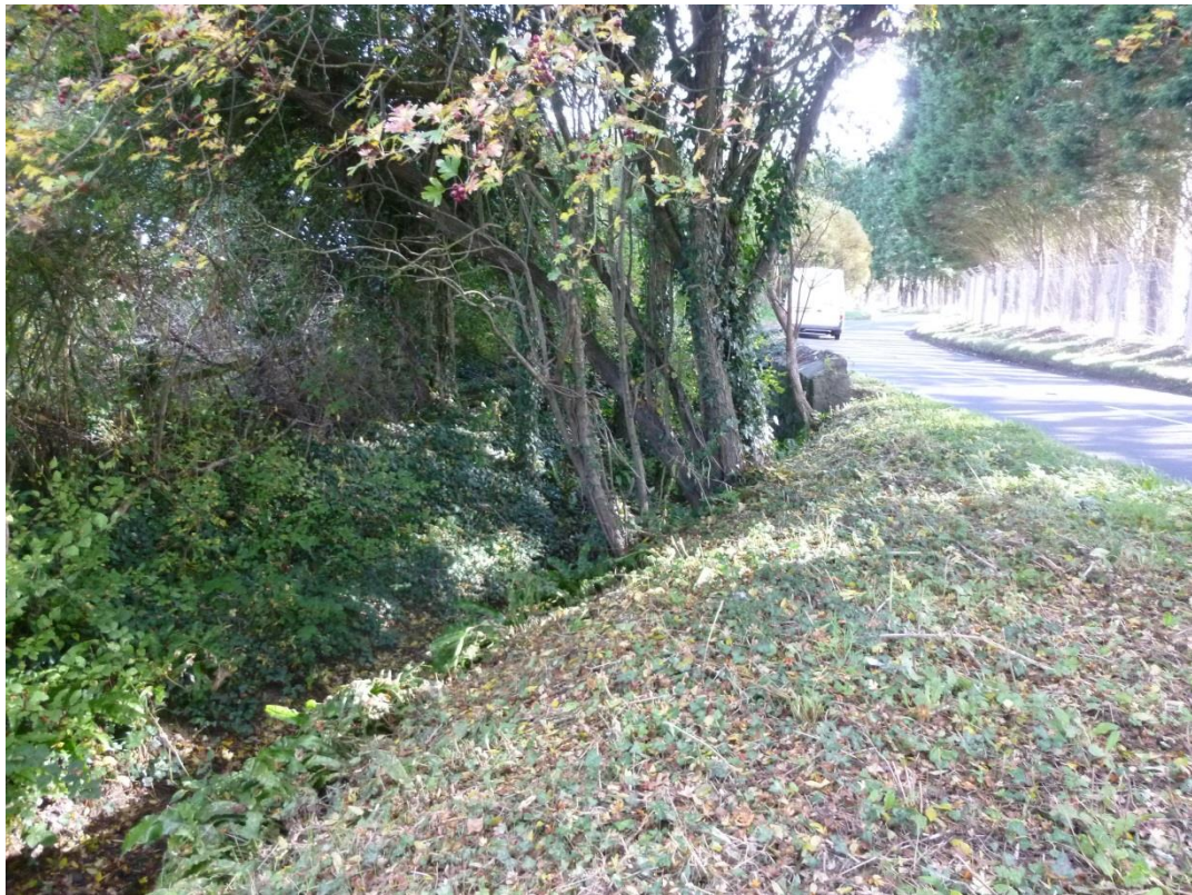
Figure 8-Boverton Brook, Upstream Extent of Received NRW Model