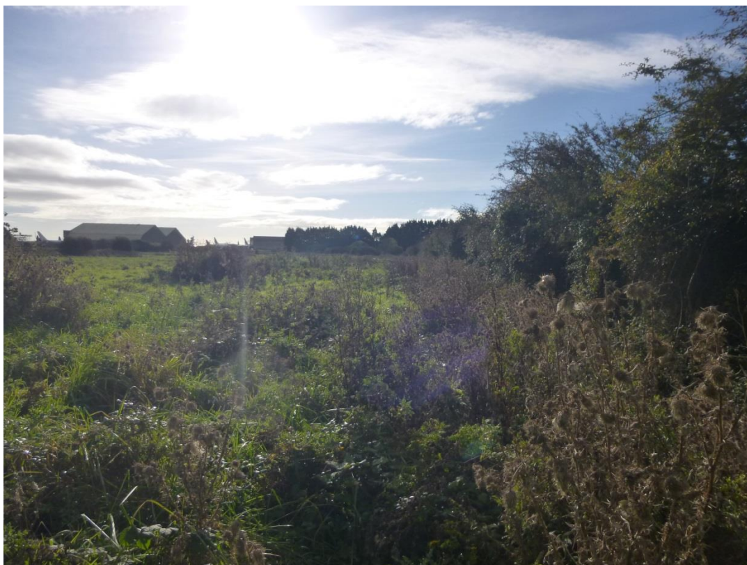
Figure 11- Typical Overgrown Section of Boverton Brook