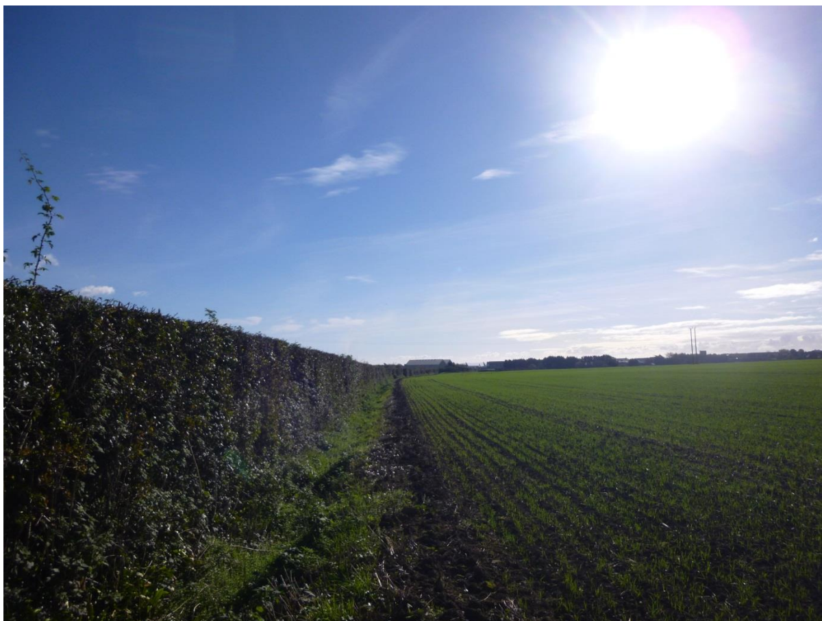
Figure 12- Upstream Extent of Boverton Brook Model Extension