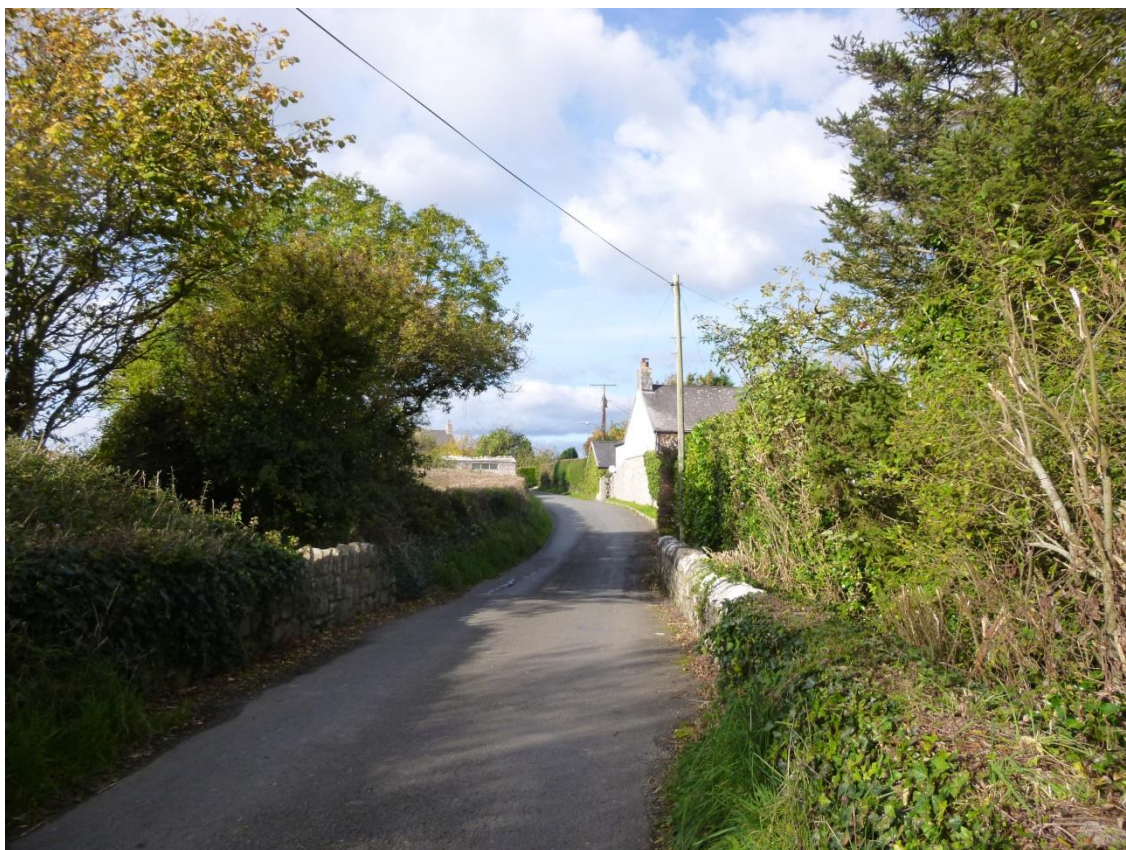
Figure 2- Froglands Farm Bridge