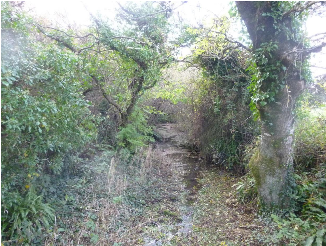
Figure 6- Boverton Brook Upstream of Froglands Farm