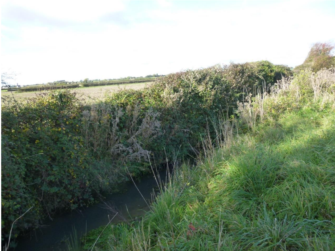
Figure 9- Boverton Brook, Looking Upstream from Downstream Extent of Model Extension