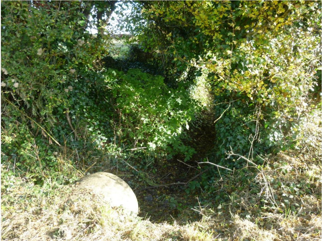
Figure 7-Outlet of Culvert on Boverton Brook