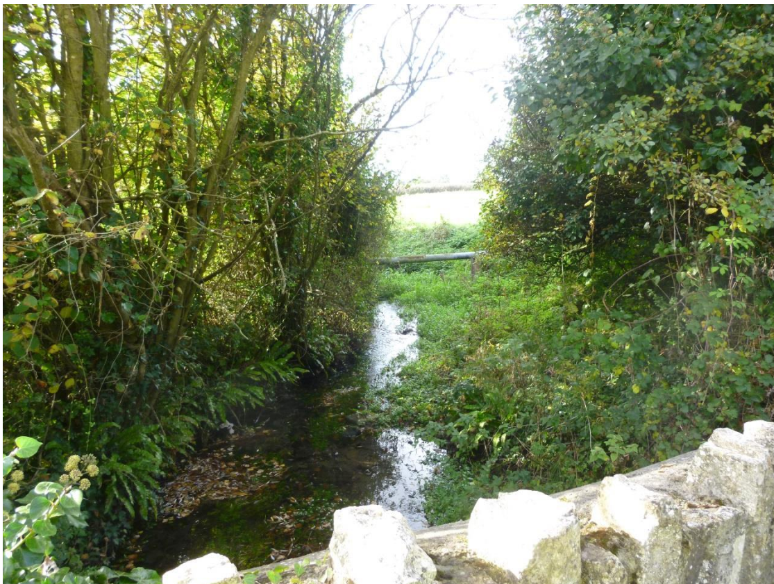
Figure 3- Looking Downstream from Froglands Farm Bridge