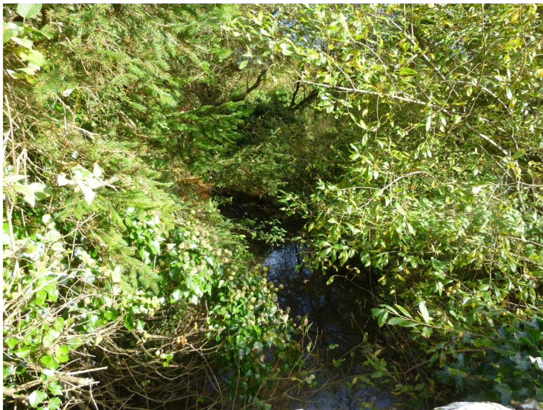
Figure 4- Looking Upstream from Froglands Farm Bridge