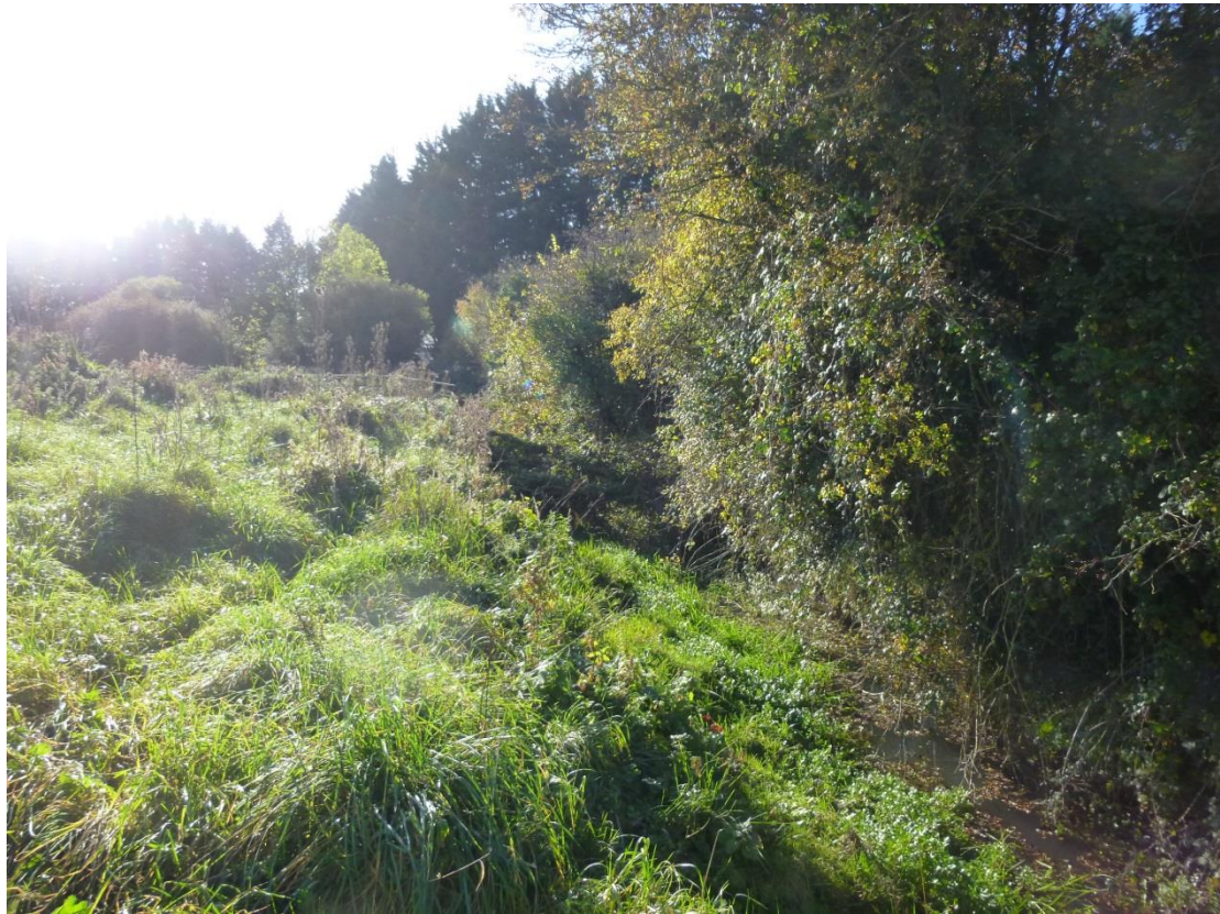
Figure 10- Looking Downstream at Downstream Extent of Boverton Brook Extension