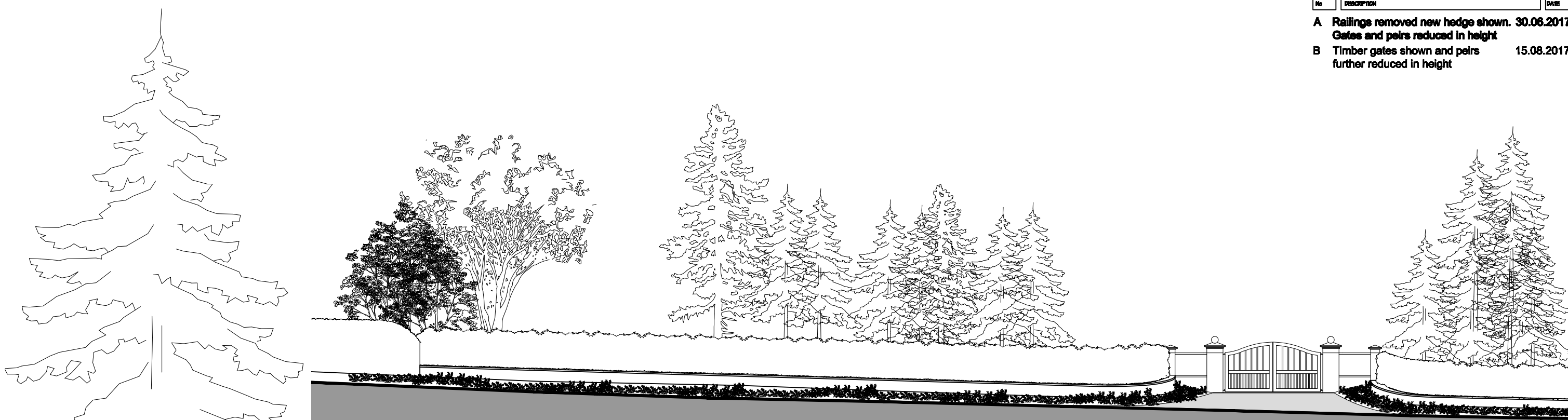
ELEVATION OF PROPOSED NEW BOUNDARY WALL AND ENTRANCE GATES 1:200