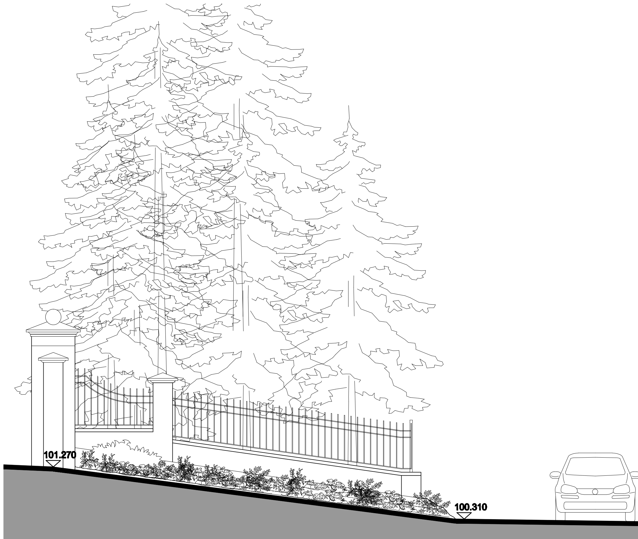
Sectional Elevation B