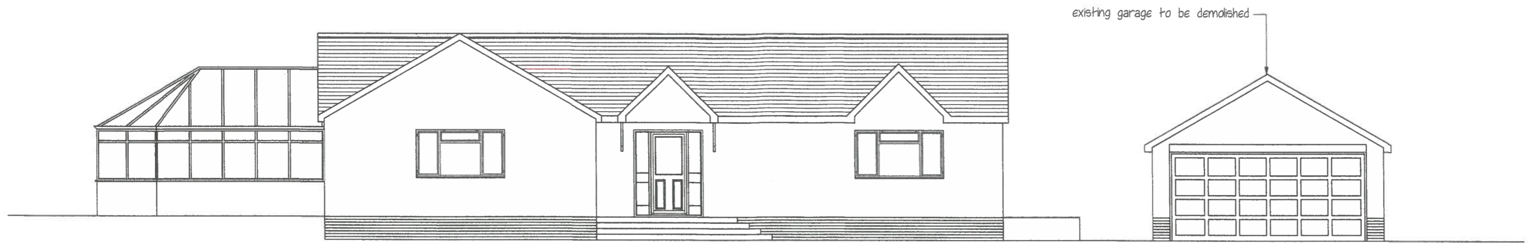
Existing front elevation