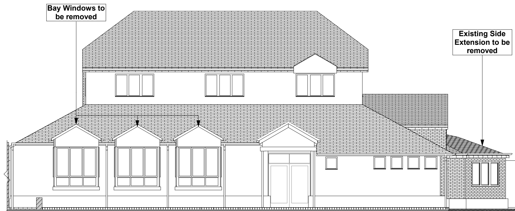
Existing Side Elevation @1:100