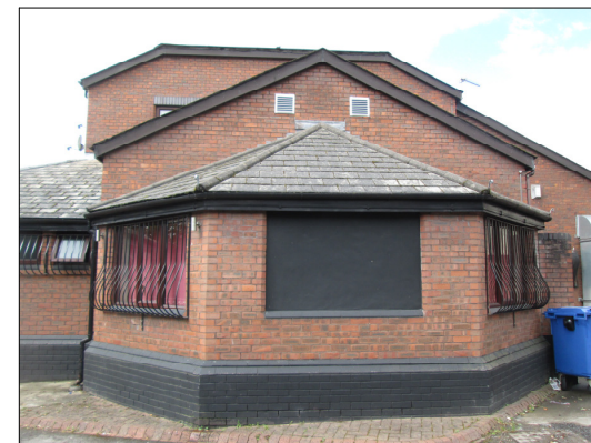
Existing Side Photograph