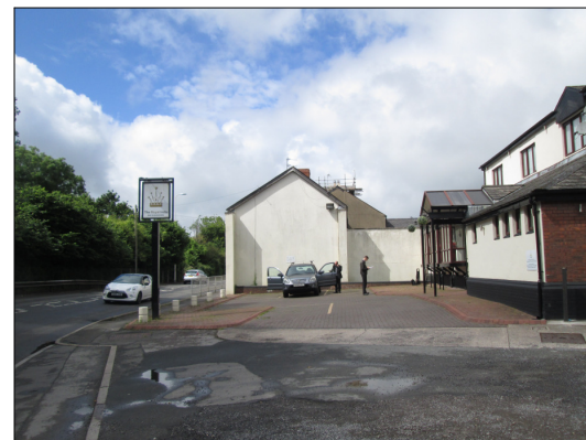
Existing Side Photograph