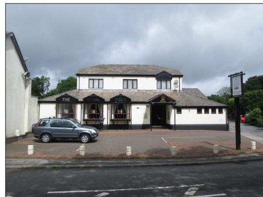
Existing Front Photograph