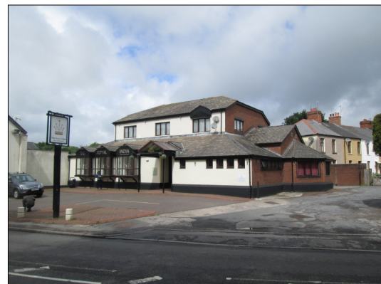
Existing Side Photograph