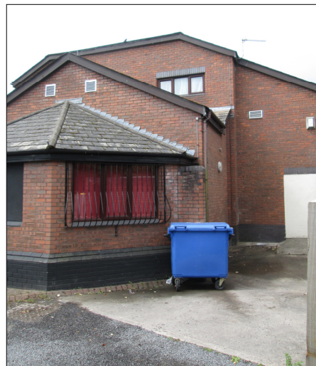
Existing Side Photograph