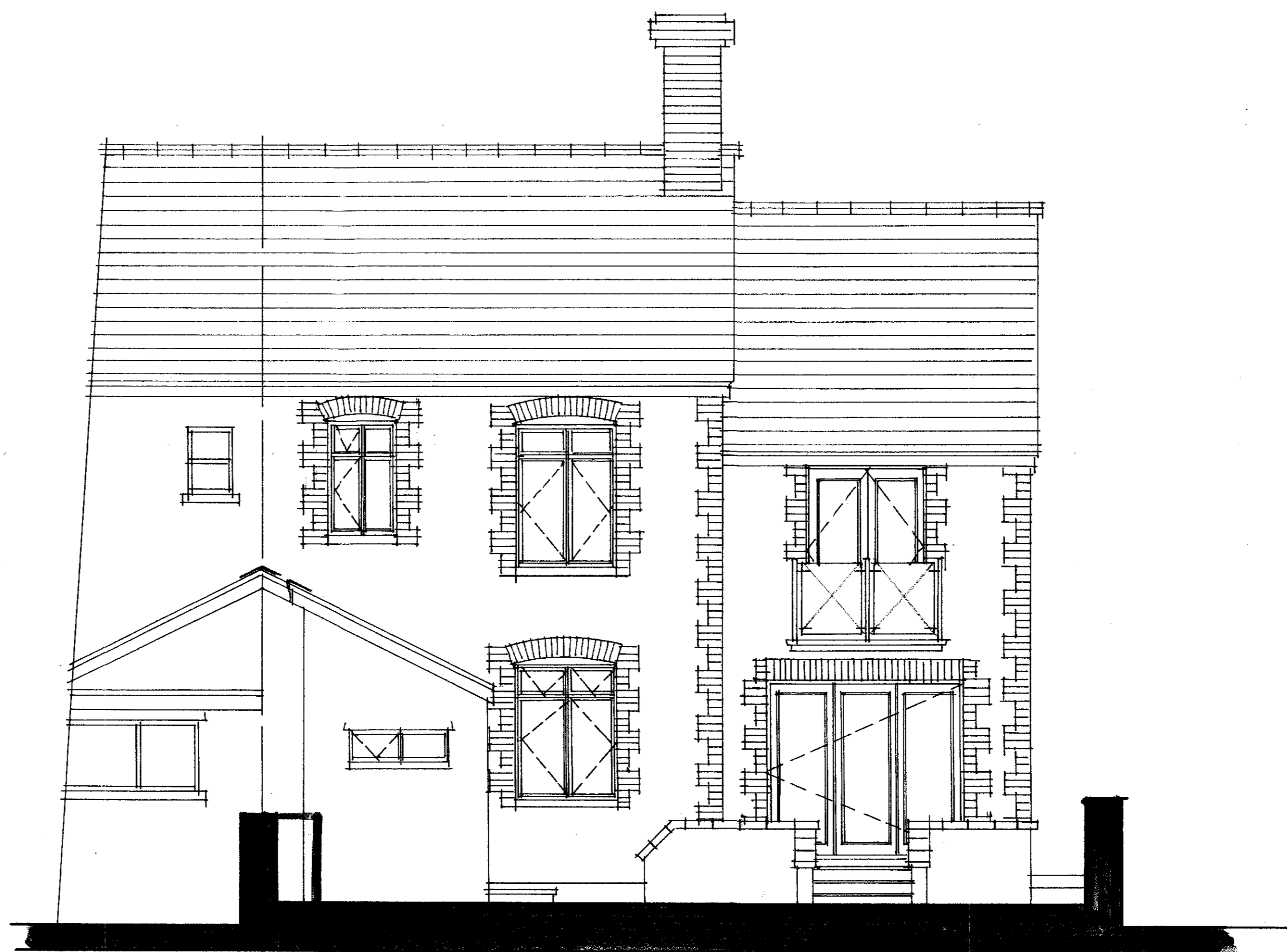
PROPOSED REAR ELEVATION [NORTH]