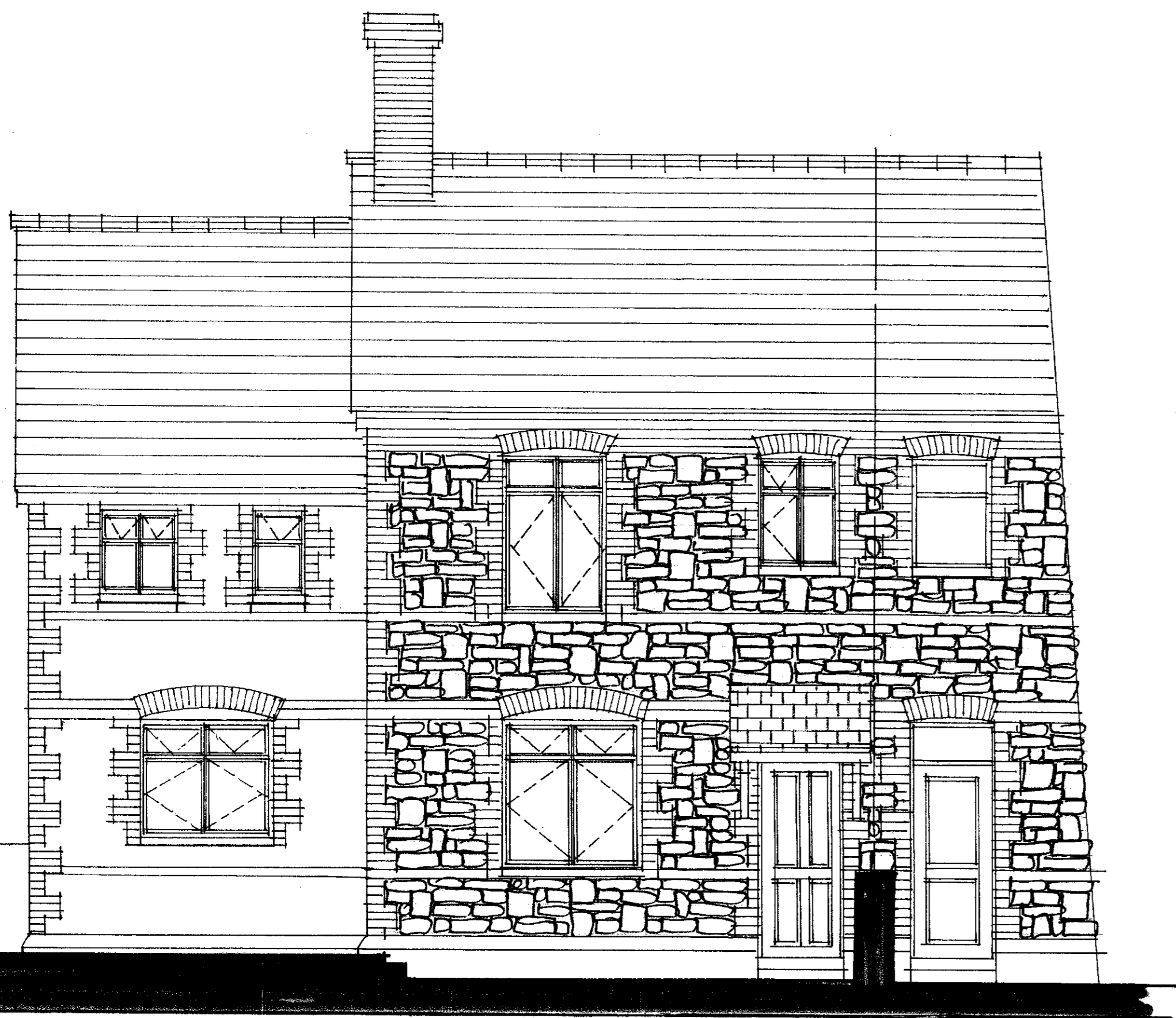
PROPOSED FRONT ELEVATION [SOUTH]