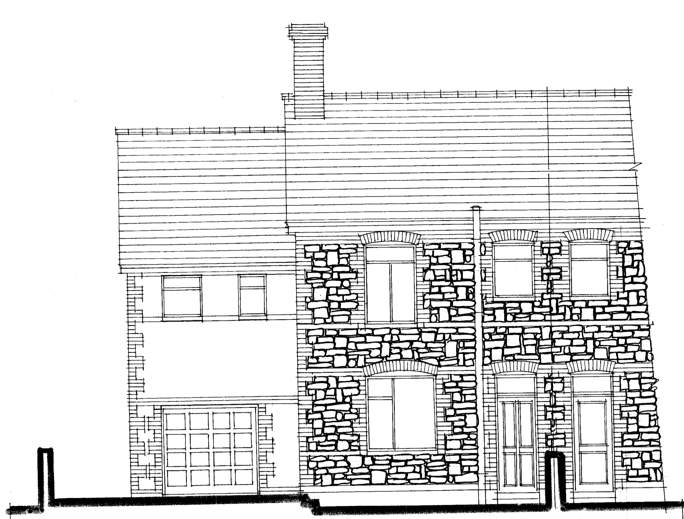
EXISTING FRONT ELEVATION [SOUTH]