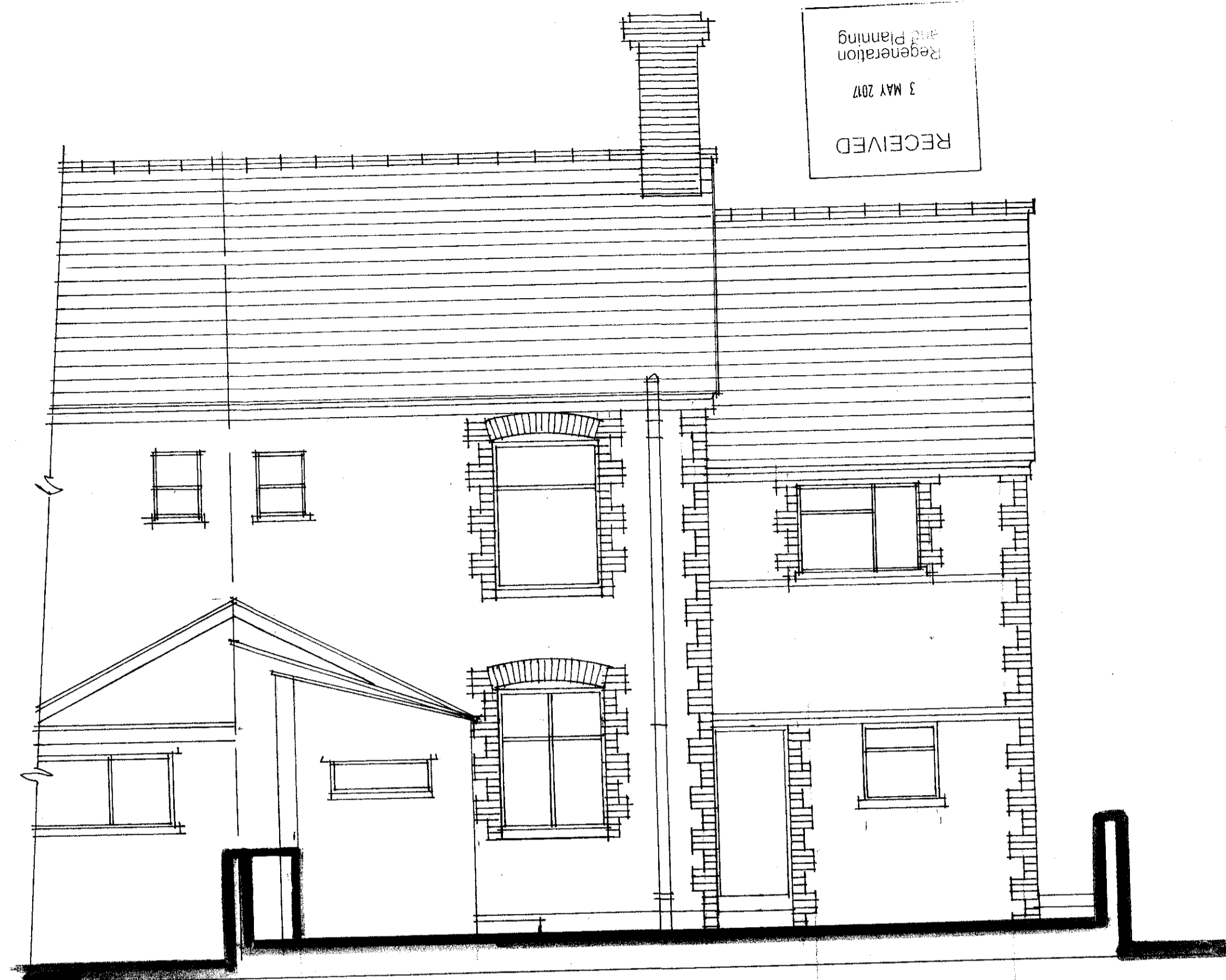
EXISTING REAR ELEVATION [NORTH]