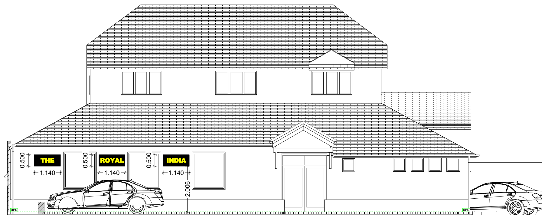
Proposed Side Elevation @1:100