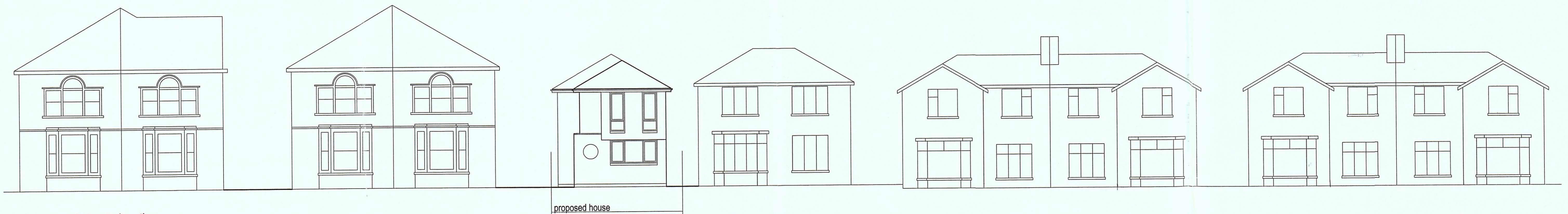
stacey road street elevation