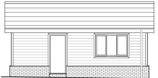
REAR/NORTH EAST ELEVATION