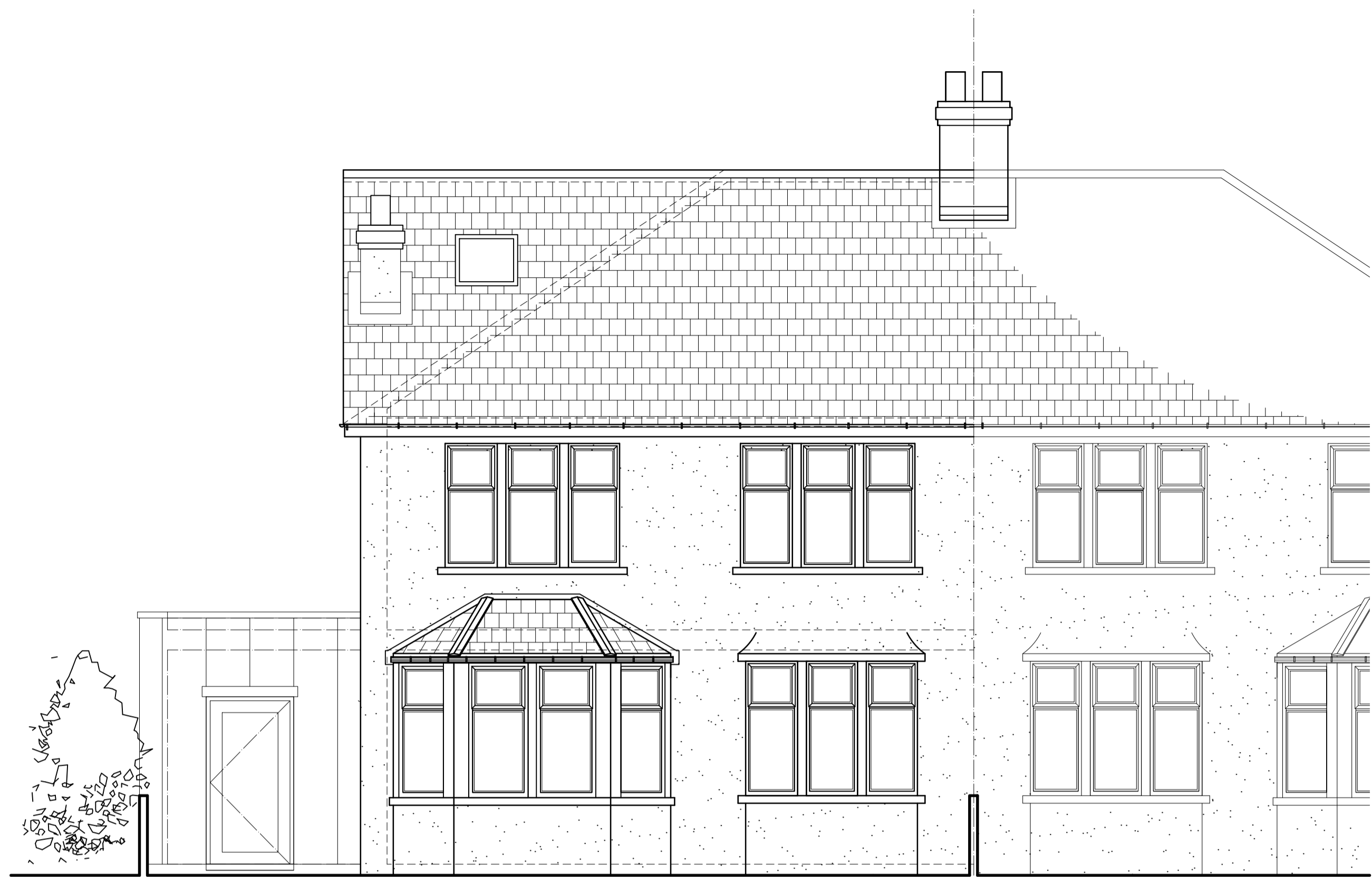
FRONT ELEVATION - Proposed