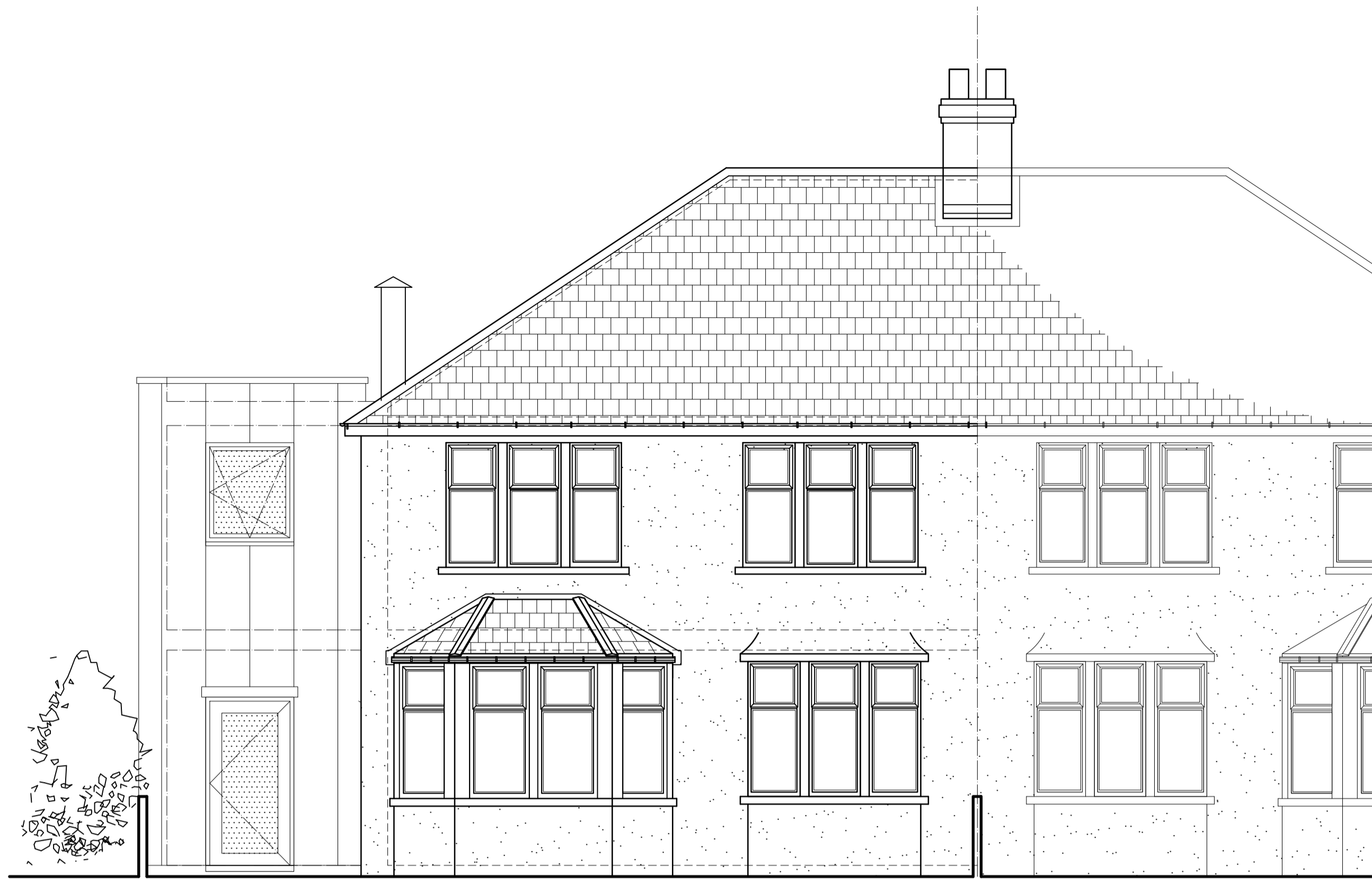
FRONT ELEVATION - Proposed