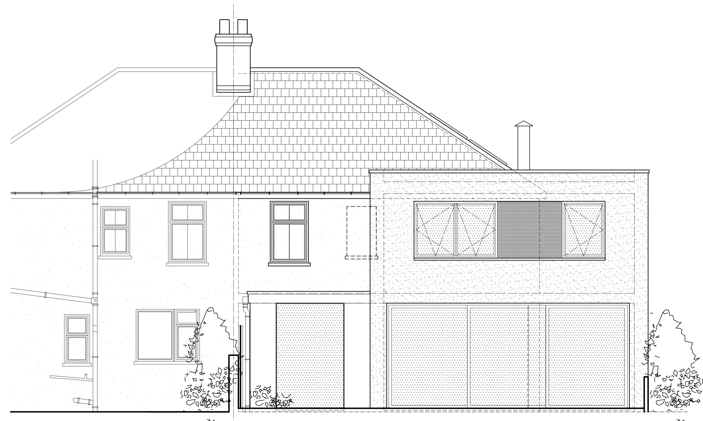
REAR ELEVATION - Proposed