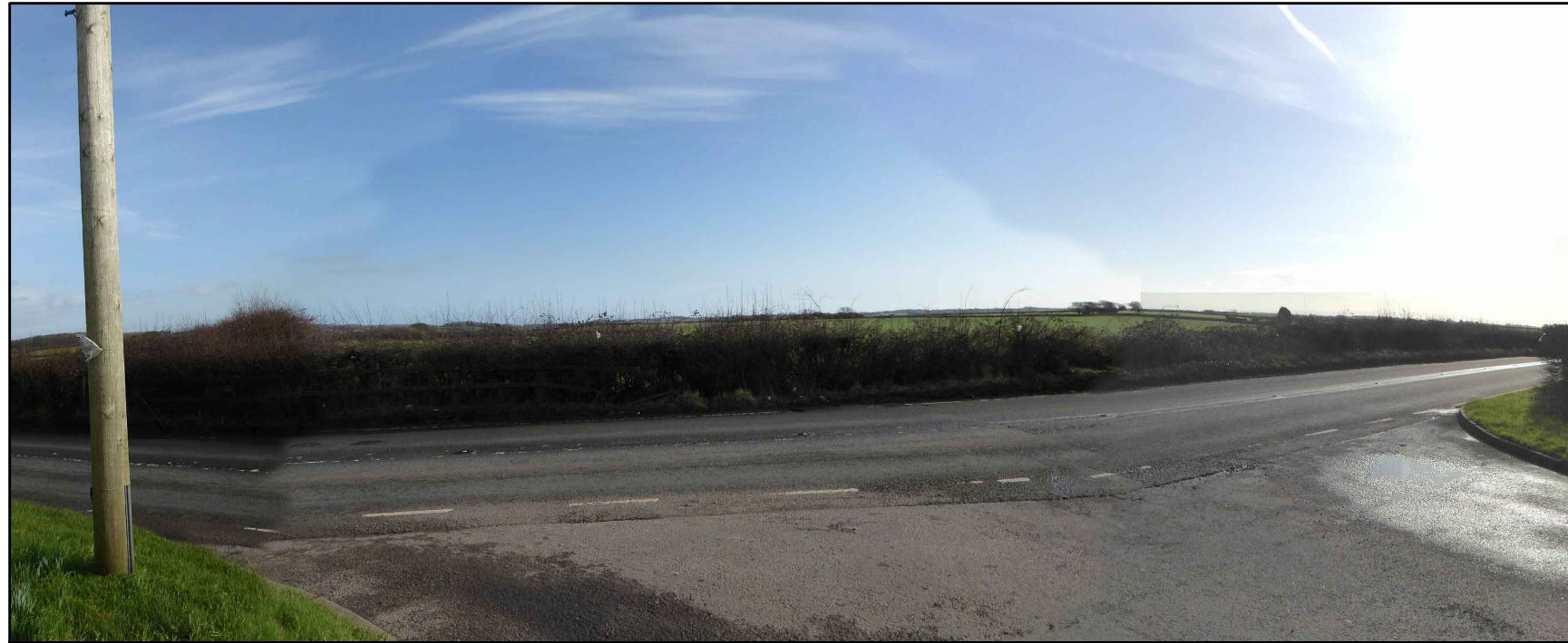
Key view 3 Distance from scheme centreline: 105m Orientation: East Angle of View: approx. 110 °