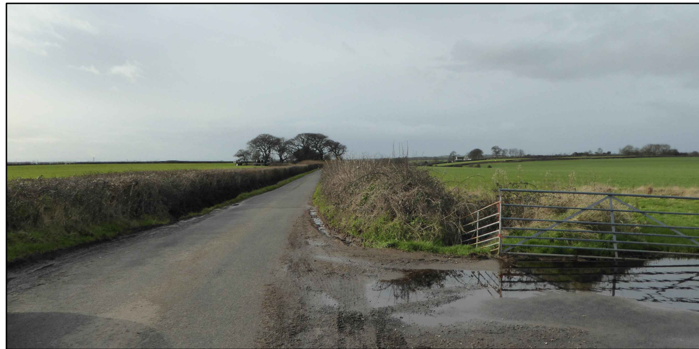
Key view 4 Distance from scheme centreline: 325m Orientation: West-southwest Angle of View: approx. 120 °