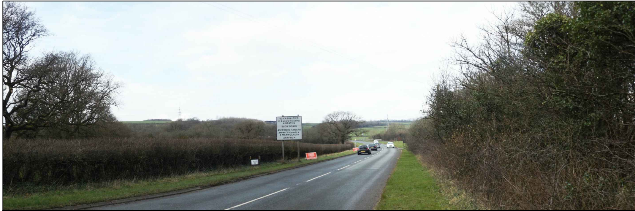
Key view 9 Distance from scheme centreline: 10m Orientation: North-west Angle of View: approx. 100 °