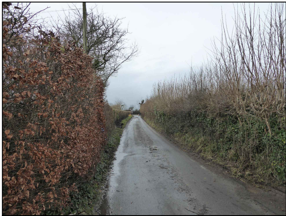
Key view 5 Distance from scheme centreline: 70m Orientation: West Angle of View: approx. 90 °