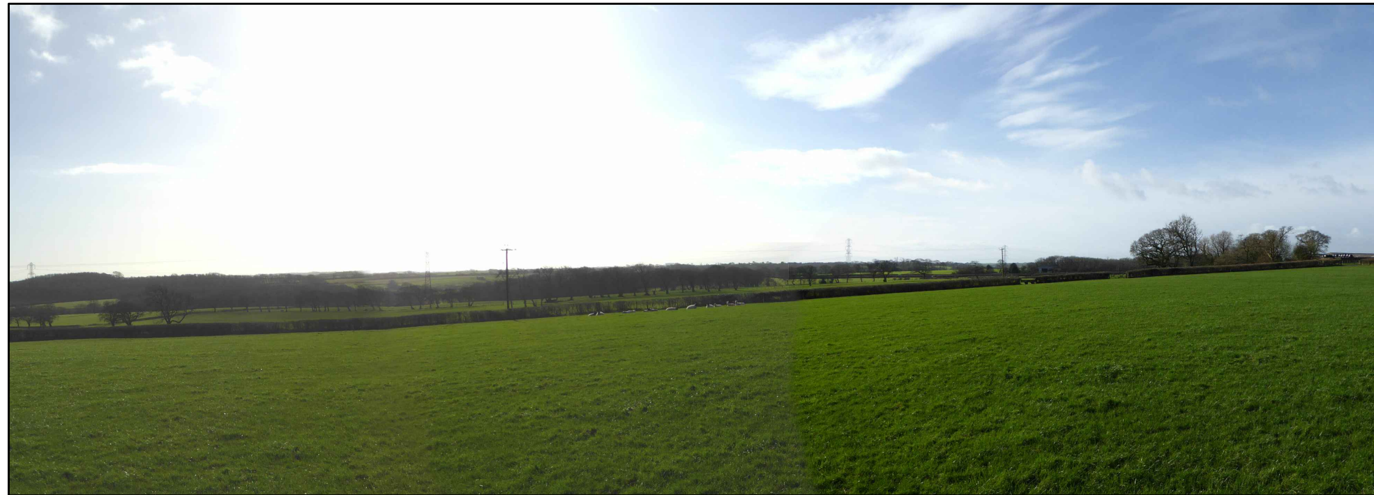
Key view 2 Distance from scheme centreline: 1090m Orientation: South-southwest Angle of View: approx. 135 °