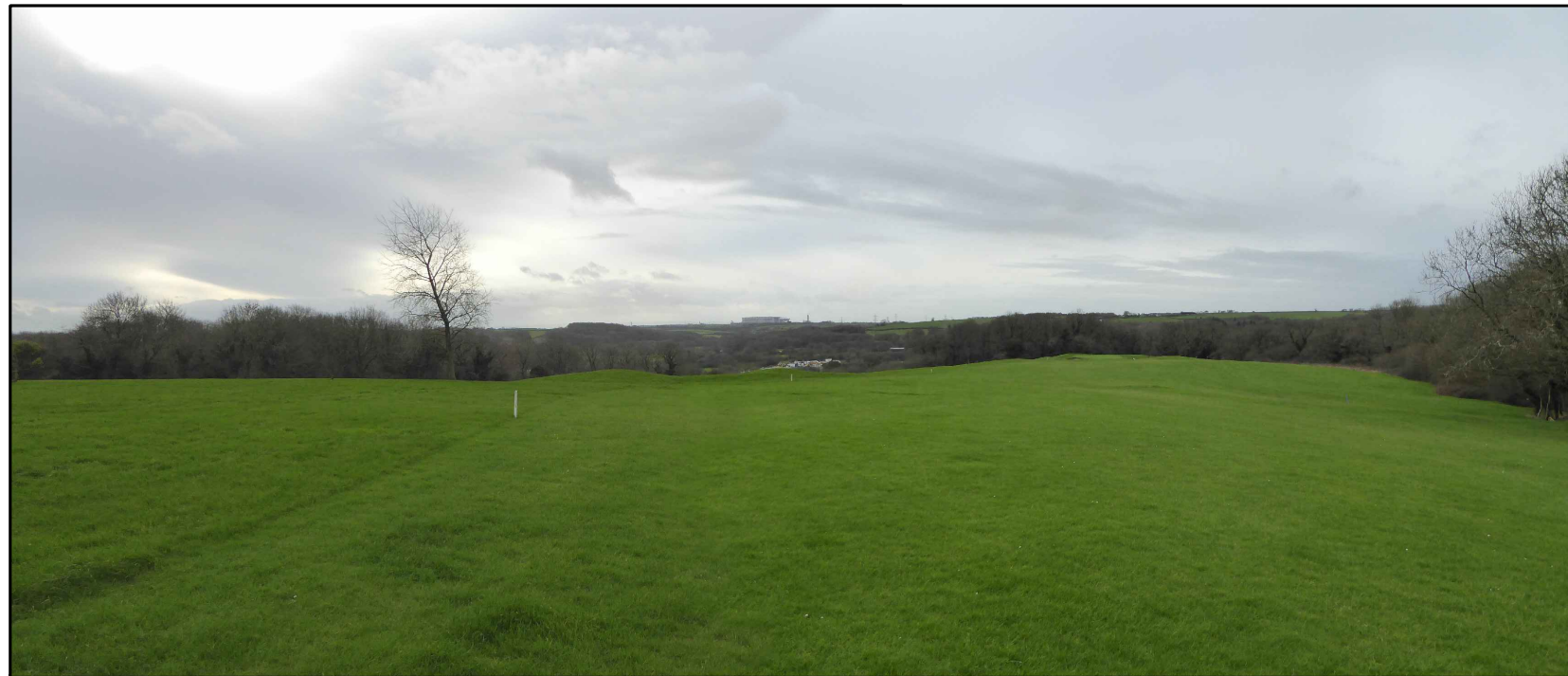
Key view 8 Distance from scheme centreline: 850m Orientation: South-west Angle of View: approx. 135 °