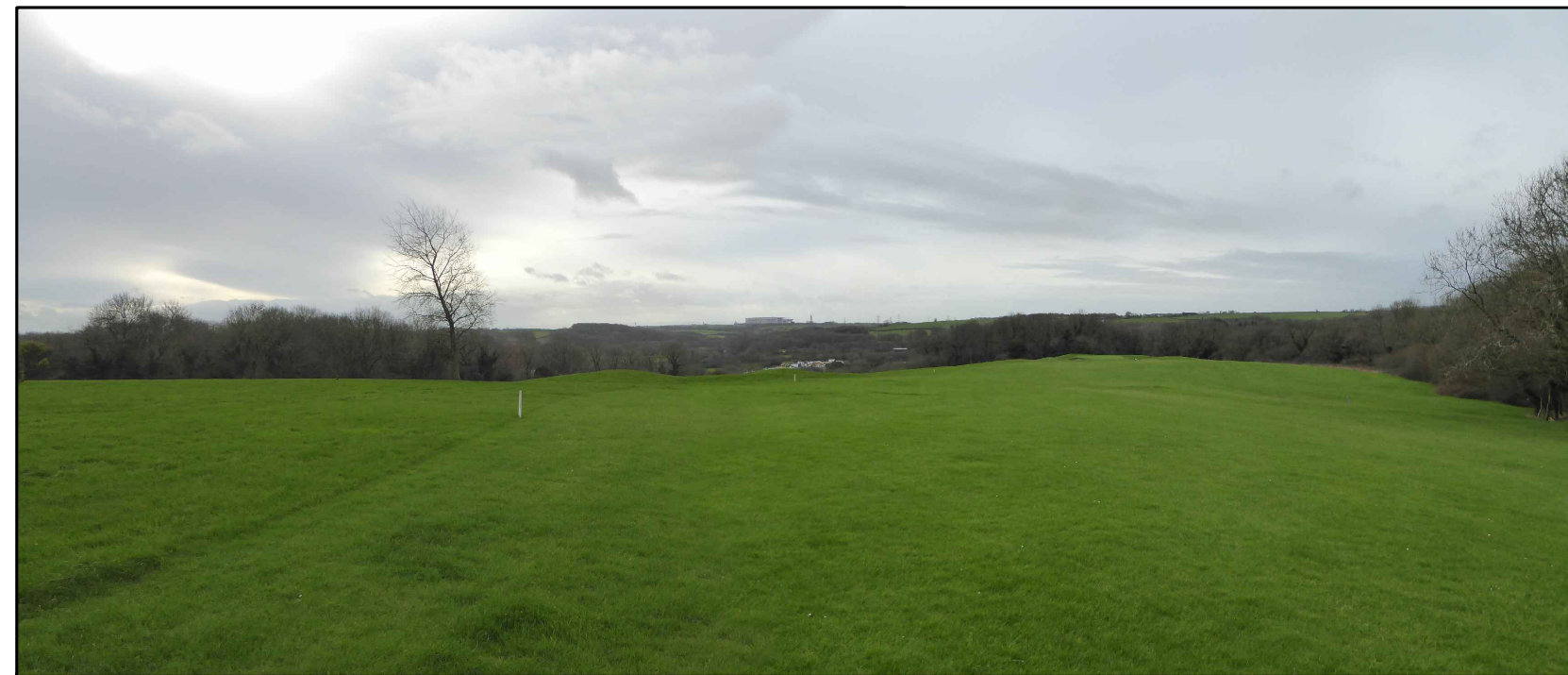
Key view 8 Distance from scheme centreline: 850m Orientation: South-west Angle of View: approx. 135 °