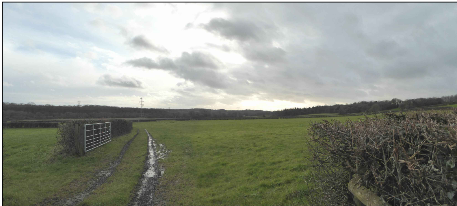
Key view 6 Distance from scheme centreline: 920m Orientation: South-southwest Angle of View: approx. 135 °