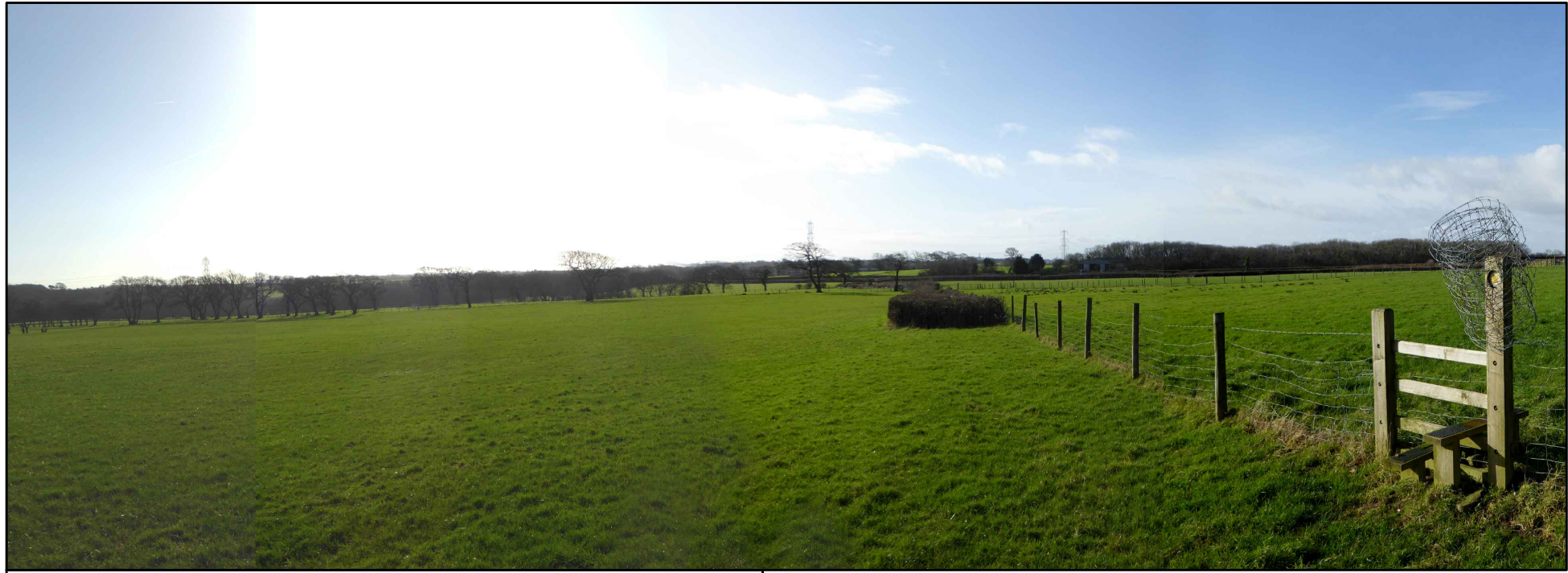
Key view 1 Distance from scheme centreline: 990m Orientation: South Angle of View: approx. 135 °