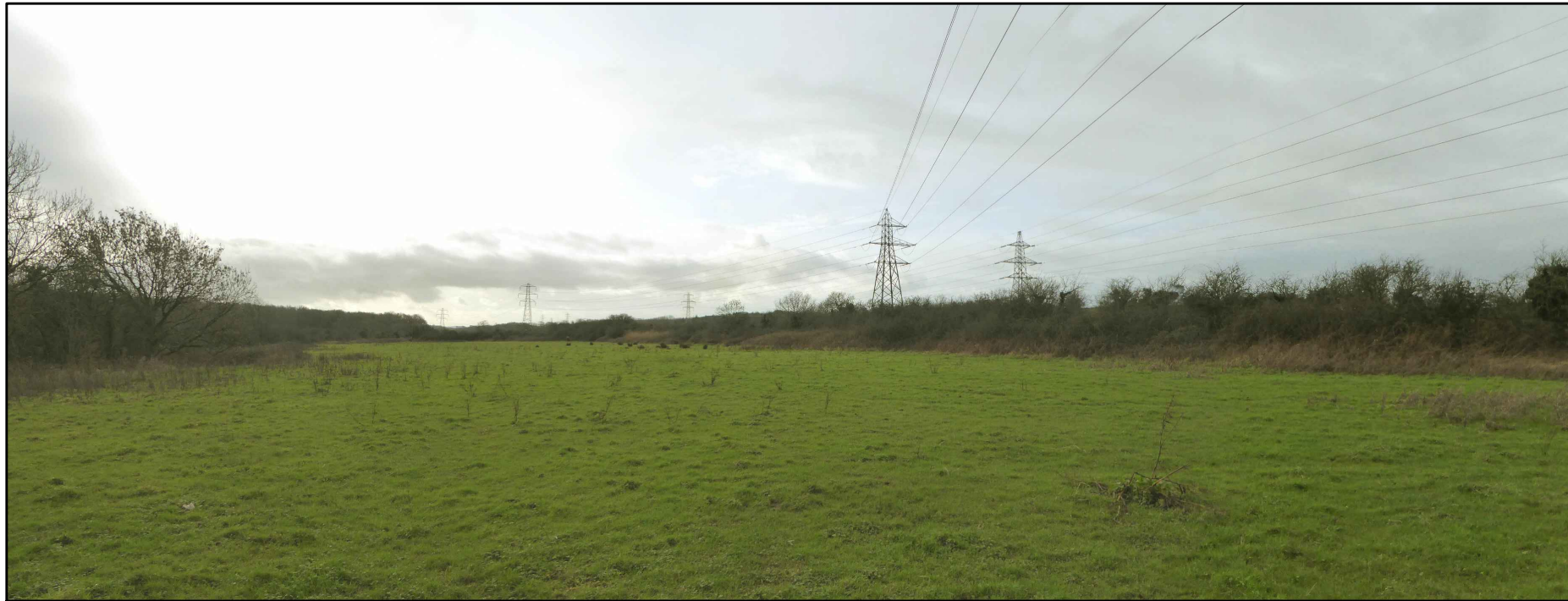
Key view 7 Distance from scheme centreline: 980m Orientation: South-west Angle of View: approx. 135 °