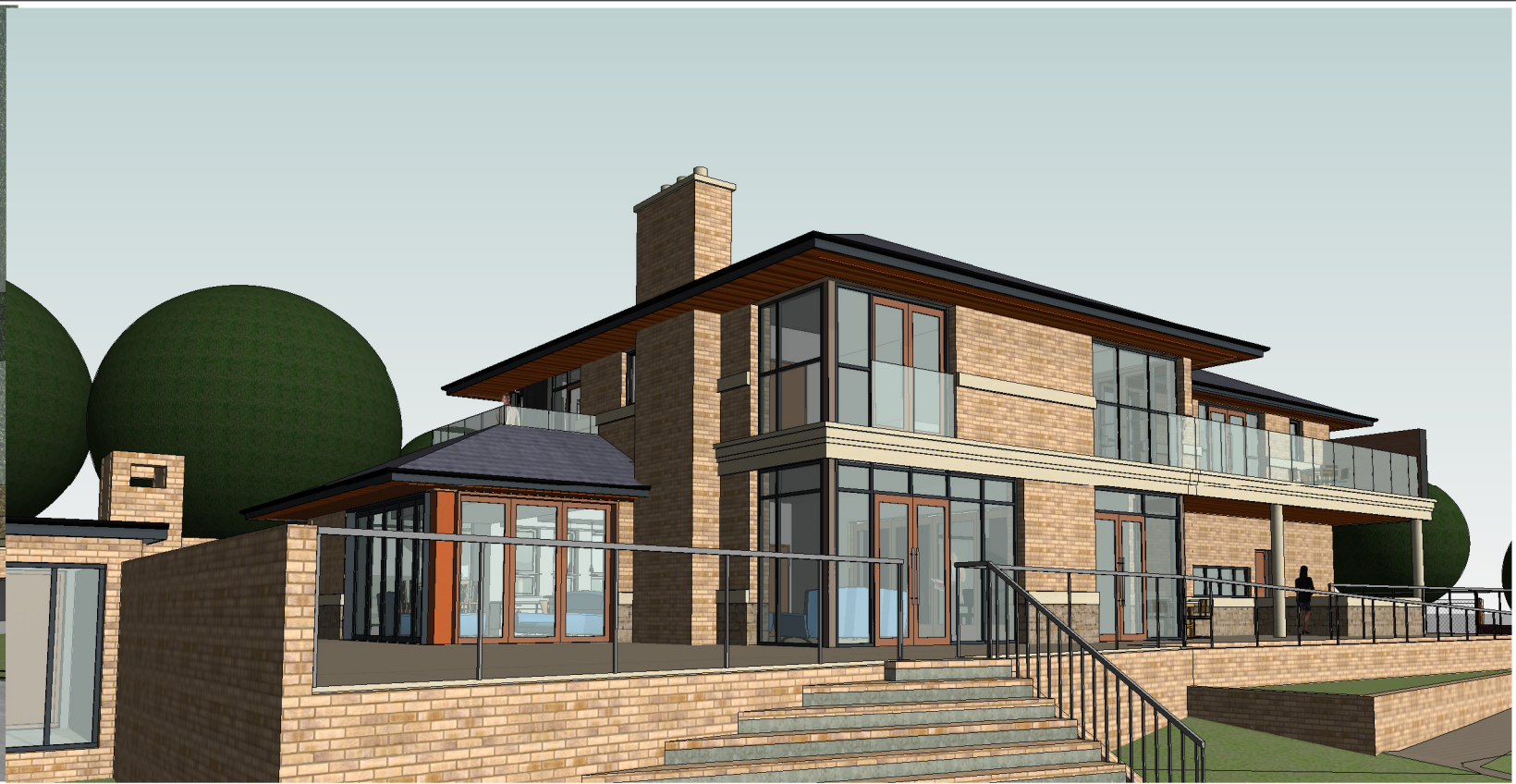
3 Rear View