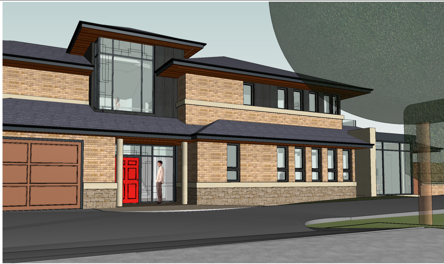
2 Front Entrance