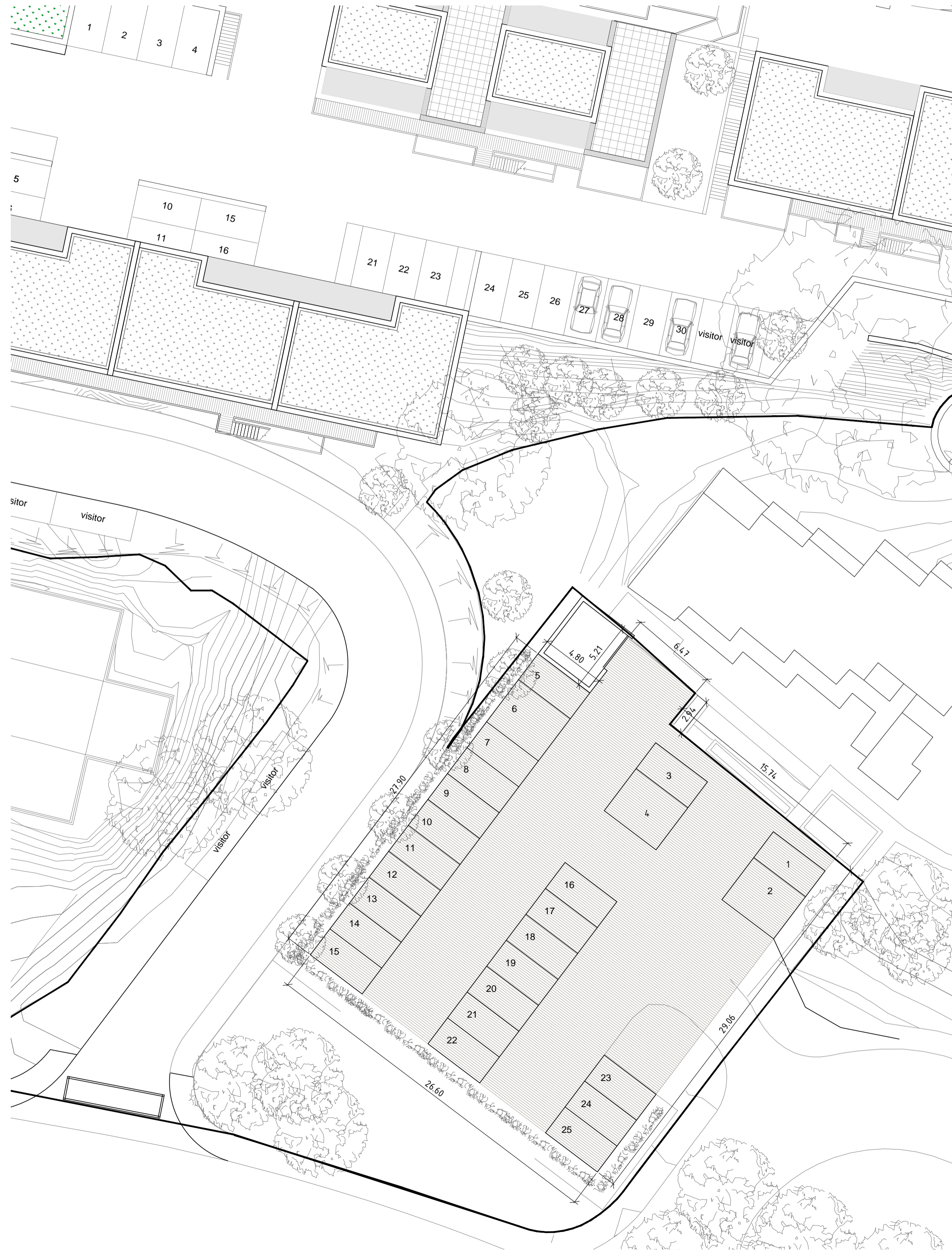
PROPOSED PARKING LAYOUT NORTHCLIFF APARTMENTS