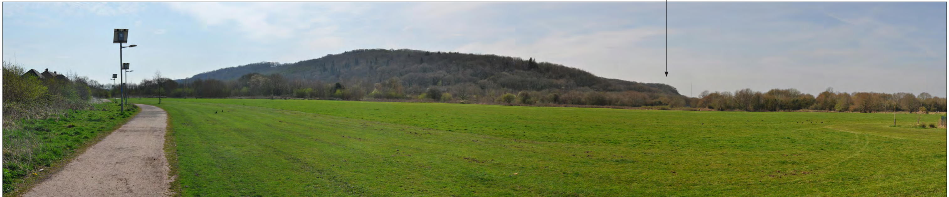
Viewpoint 8: From play area to south of Treganna school

Views of the restoration area will be restricted by a combination of distance, sloping landform and retained woodland vegetation