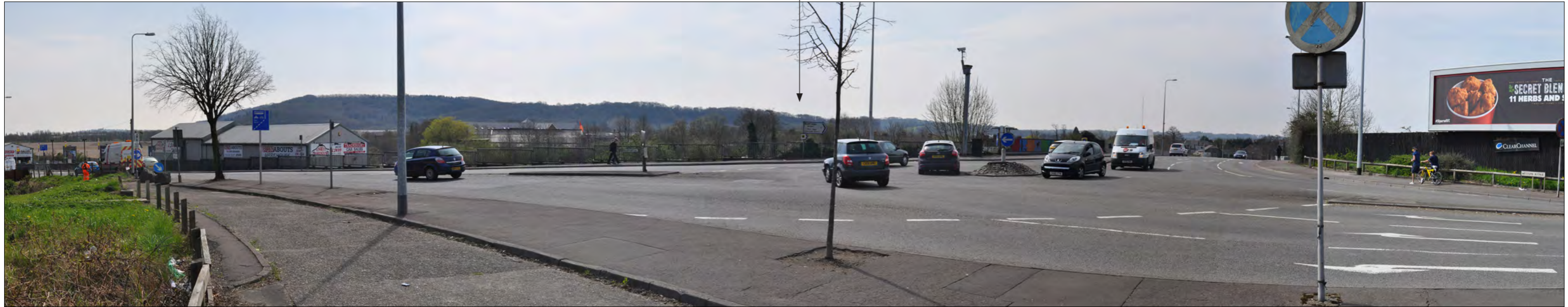
Viewpoint 7: From roundabout on A48/A4161, within Ely

It will only be from a few very limited open locations within Cardiff that the proposed restoration area has the potential to be perceived on the distant wooded ridge. However a combination of distance as well as retained woodland vegetation will ensure the proposed restoration area will be difficult to perceive although glimpses of the access road may be possible, depending on the time of year.