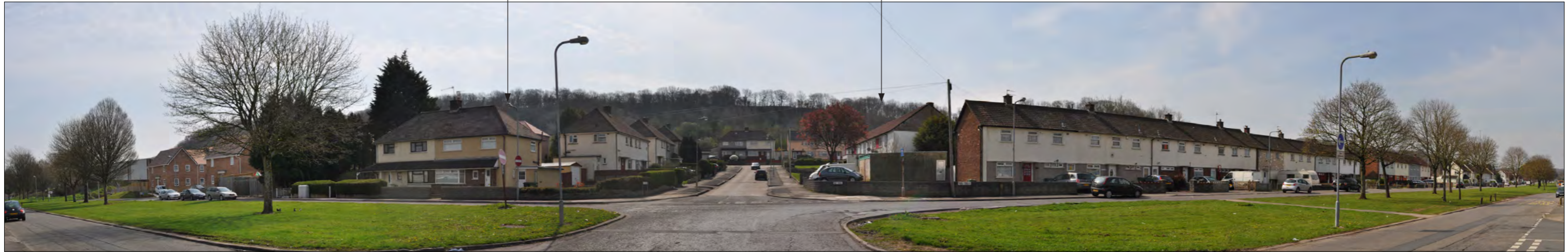
Viewpoint 5: From junction of Heol Trelai and Heol Solva, within Caerau

It is only from selected open locations within the built-up landscape of Caerau that more exposed views into the wider landscape are possible