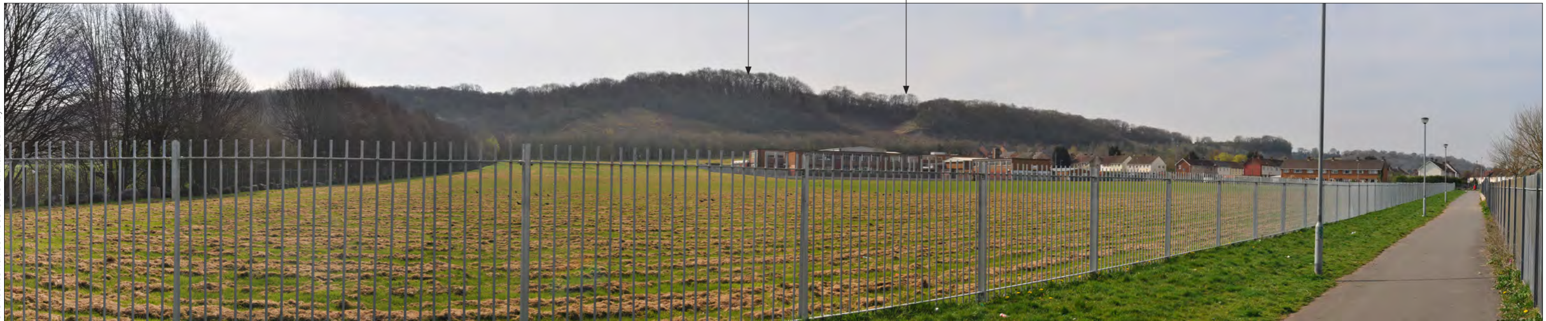
Viewpoint 6: From Trelai Park, within Caerau

It is only from selected open locations within the built-up landscape of Caerau that more exposed views into the wider landscape are possible