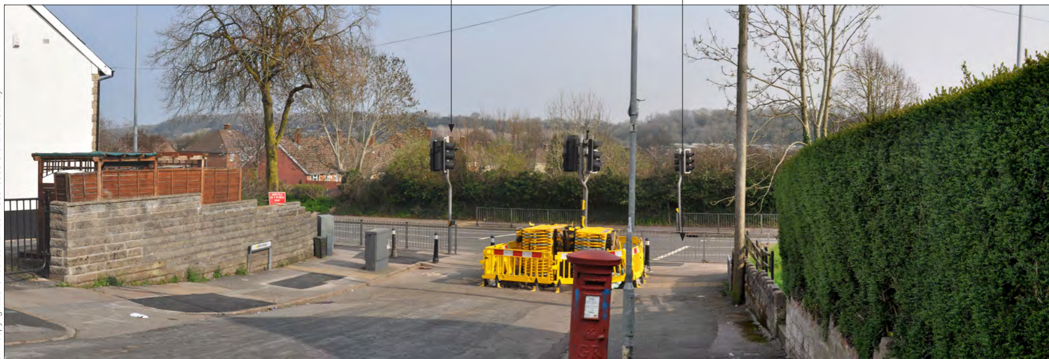
Viewpoint 4: From minor road (Parker Road) off A48, within Ely

A48, that passes through Cardiff, is largely enclosed by surrounding development