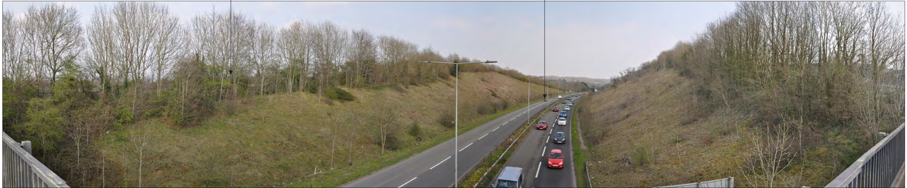
Viewpoint 3: From bridge over A4232

A4232 in well-vegetated cutting provides a barrier between the urban fringes of Cardiff and the agricultural and wooded landscapes of the Vale