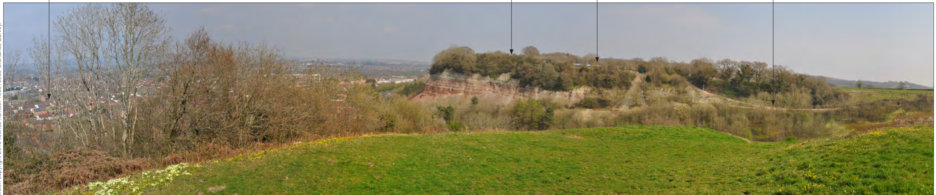
Viewpoint 2: From Caerau Camp

Existing access road is largely enclosed by mature vegetation