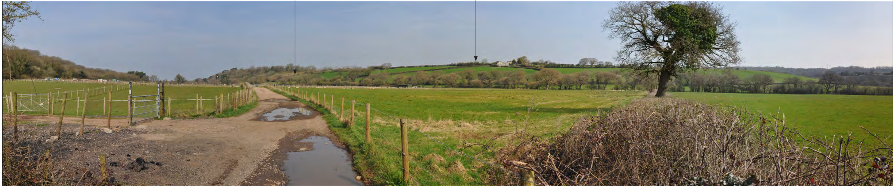
Viewpoint 1: From public right of way

Any views of the proposed restoration area will be restricted by the intervening sloping landform and mature vegetation