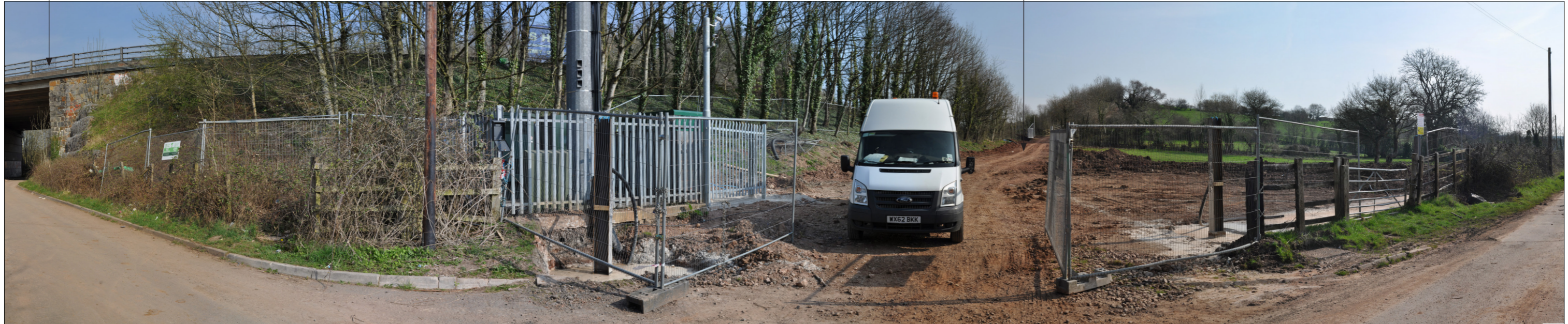
Site photo 1: From Cwrt-yr-Ala Road

Existing access road leading to the proposed restoration area is largely enclosed by mature vegetation which will restrict its influence on the wider landscape