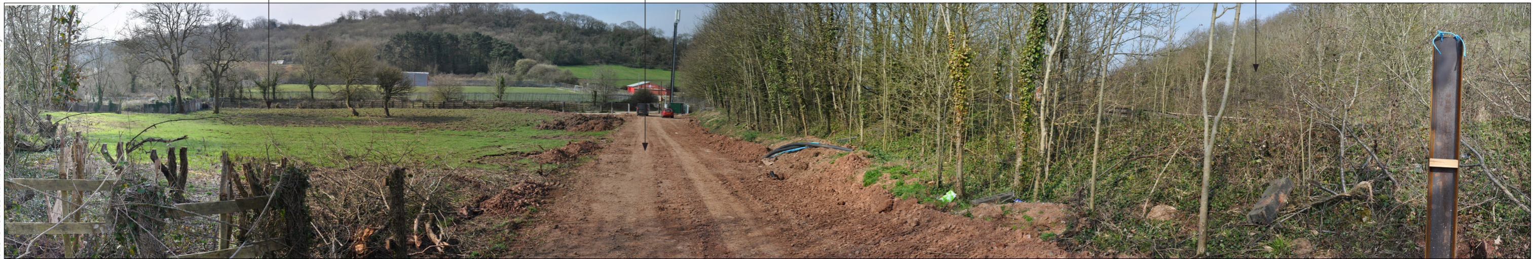
Site photo 2: From existing access road

A4232 obscured by a combination of screening by mature vegetation and sloping landform