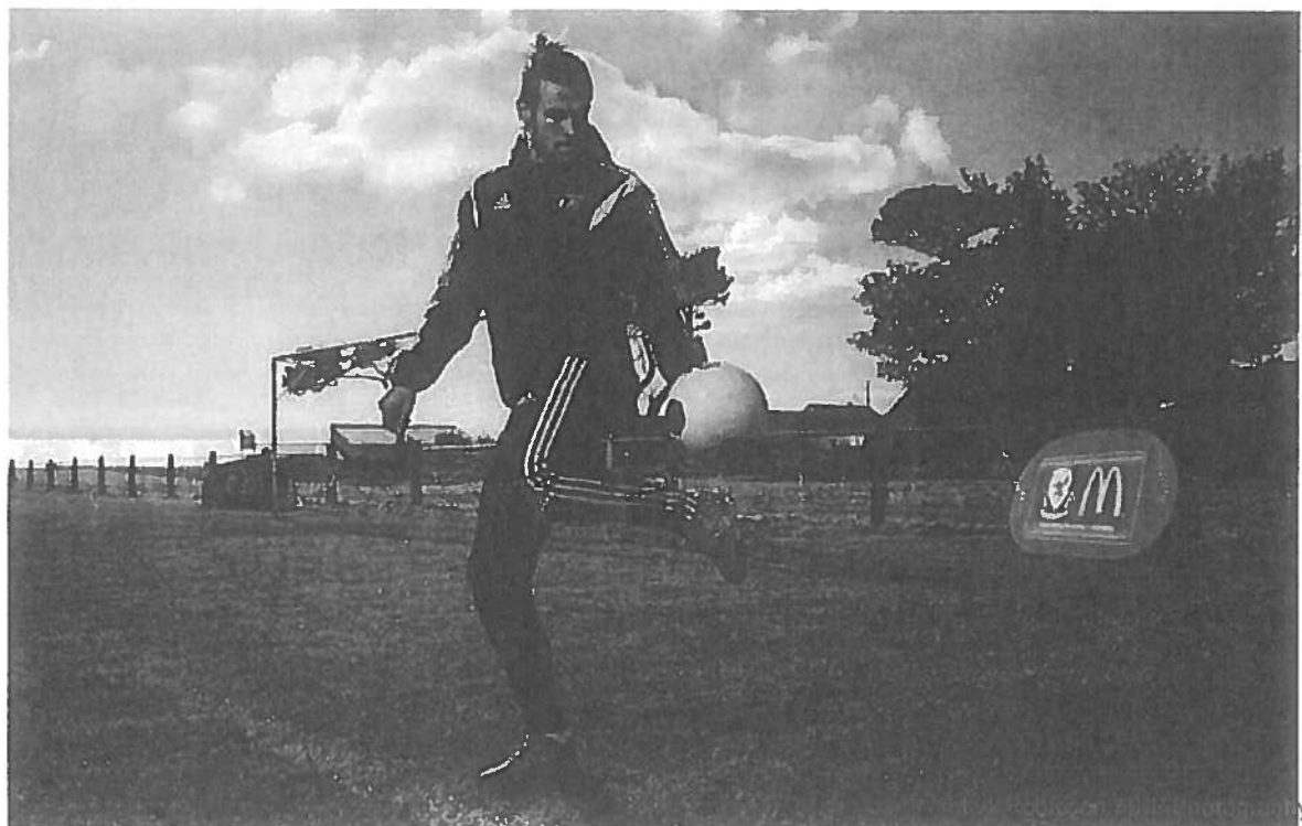
Gareth Bale helps Launch The McDonald's 100000th Kit Scheme to Sully Sports FC

He presented the kids with their new football strip for the season and gave them a master class in how to score a goal.