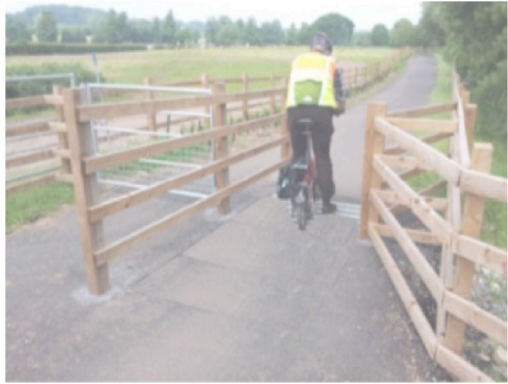
Boundary treatment example