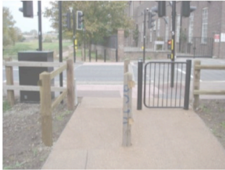
Boundary treatment example