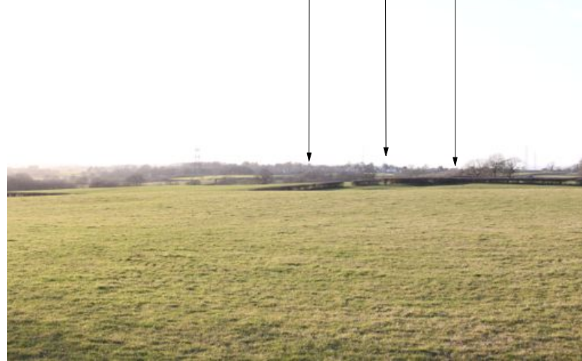
VP5: View walking north westwards to St Nicholas on Public Right of Way (Haunted Fields Walk)

This marks the easternmost extent of the proposed development