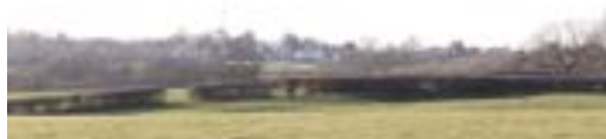
VP5: View zoomed in for clarity