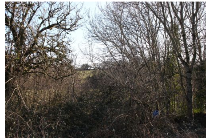
VP3: Short duration glimpse of the distant northern boundary of the proposed development through well vegetated tree and hedgerow

This field will form the northern part of the proposed development