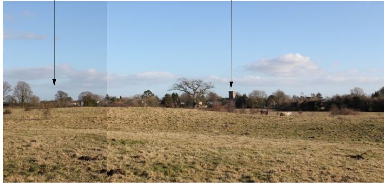
VP4: View walking southwards to St Nicholas on Public Right of Way

The white render of St Nicholas is just visible here