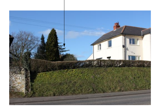
Other viewpoints typically screened by existing houses fronting the A48

Cedar of Lebanon (T48 on tree survey) on site boundary only just glimpsed