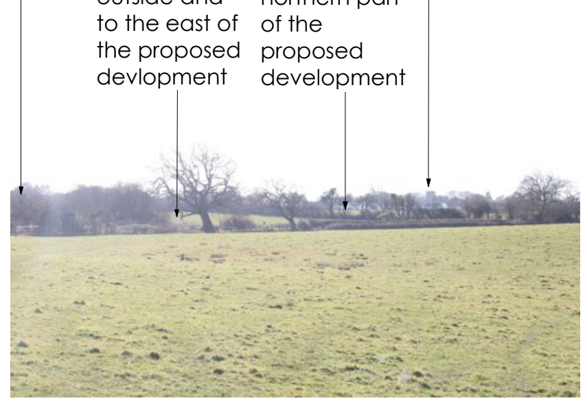
VP2: View walking southwards to the A48 on Public Right of Way (Three Saints Trail)

The easternmost extent of the development would be hidden behind this St Nicholas Church Tower hedgerow This field will form the outside and northern part