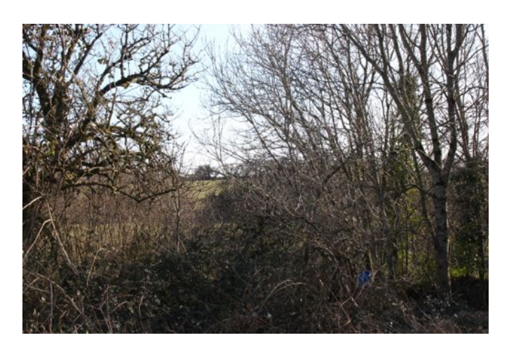
VP3: Short duration glimpse of the distant northern boundary of the proposed development through well vegetated tree and hedgeline

Views from Public Rights of Way VP2 & VP3