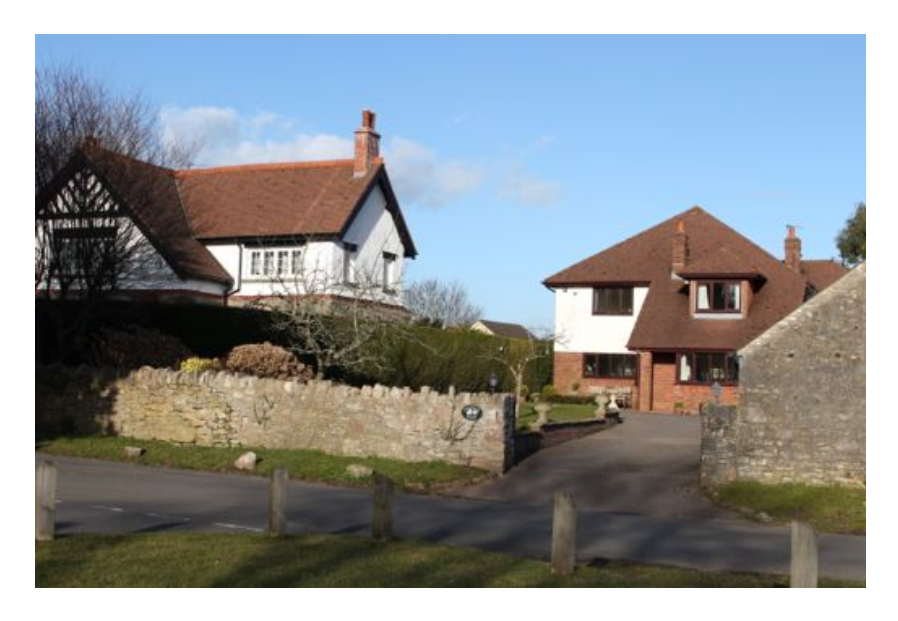
VP6: From the vicinity of the War Memorial, a glimpse through between existing houses on Well Lane towards the western boundary of the proposed development reveals only the roof top of Ger y Llan houses, so the development will not be seen from here