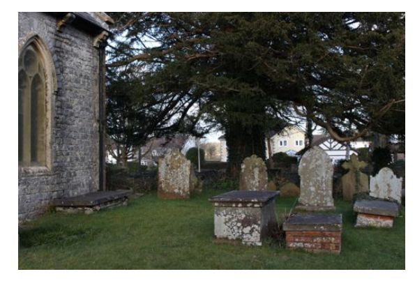
Views towards the development from the central core of the Conservation Area are blocked by houses along Well Lane, and Ger y Llan behind

Views from St Nicholas Conservation Area VP6