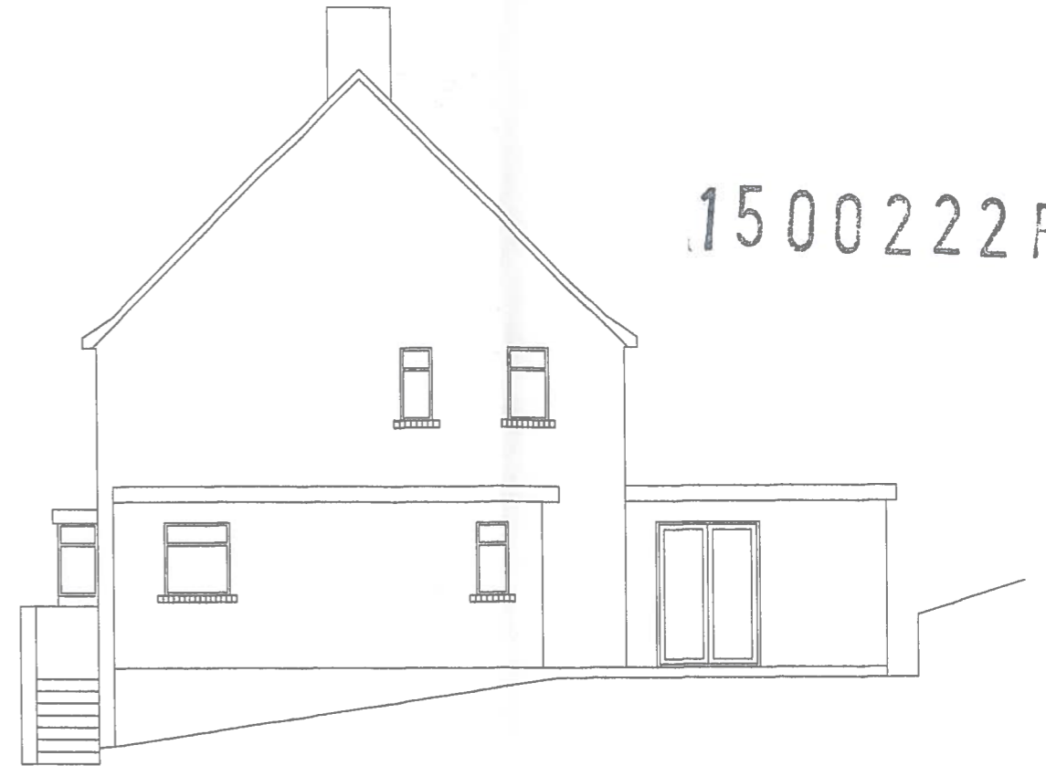
Proposed side elevation

THE VALE OF GLAMORGAN COUNCIL SUPERSEDED