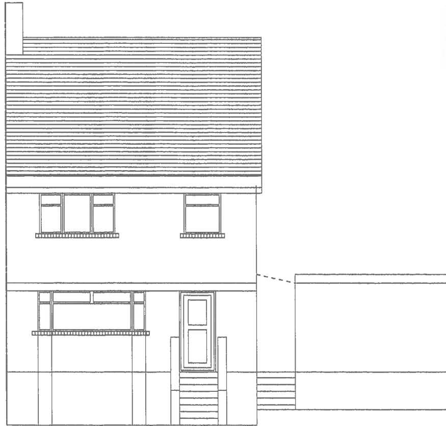
Existing front elevation

THE VALE OF GLAMORGAN COUNCIL SUPERSEDED