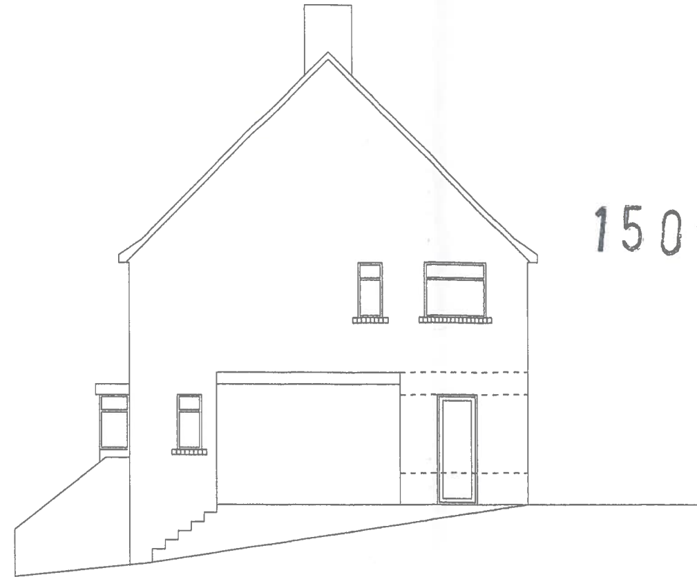
Existing side elevation