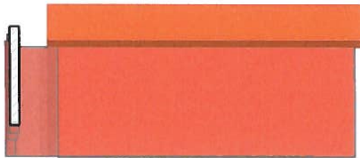
North Elevation 1:100