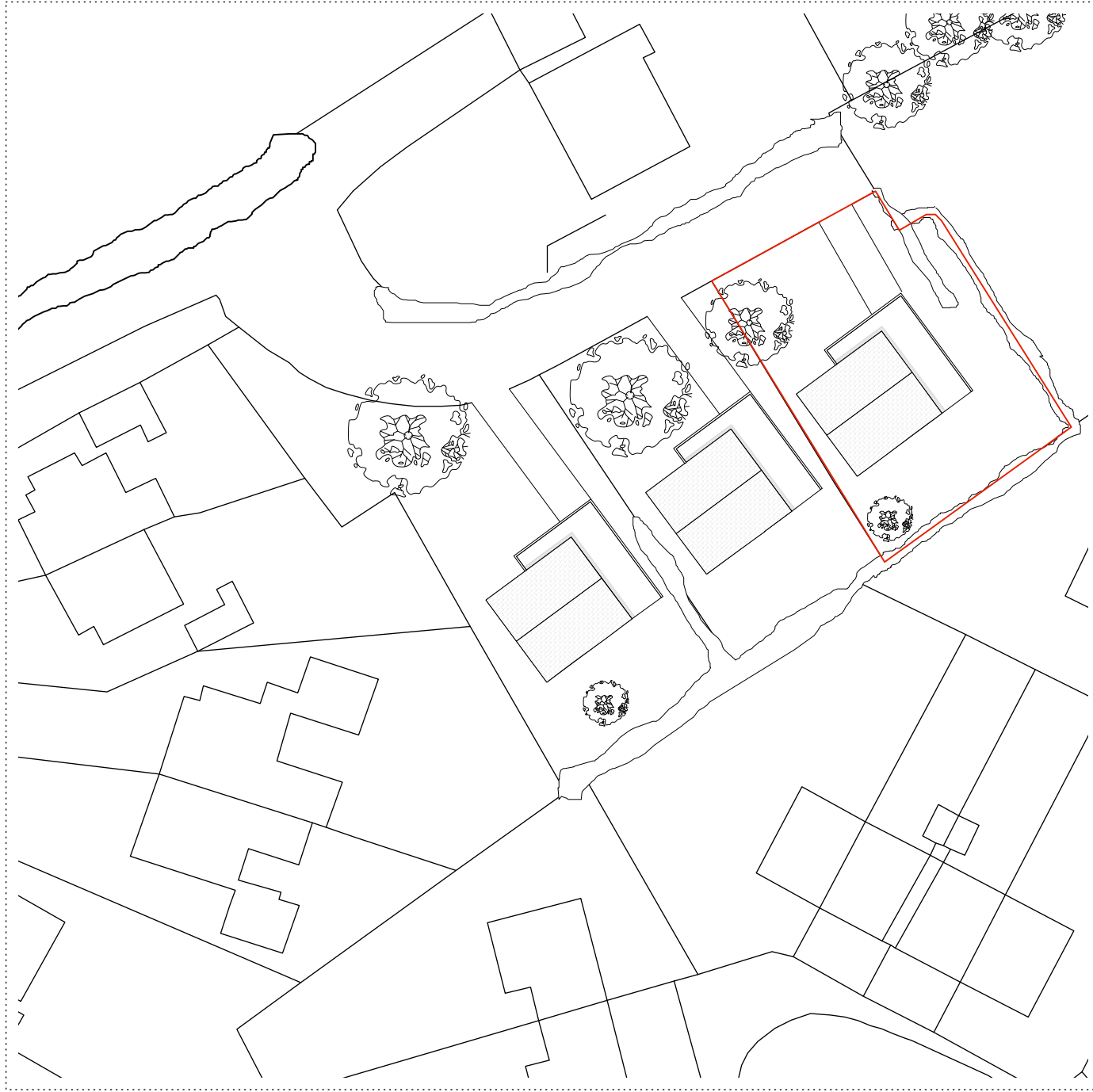
Existing Location Plan Scale 1:500

THE VALE OF GLAMORGAN COUNCIL TOWN AND COUNTRY PLANNING ACT 1990 APPROVED SUBJECT TO COMPLIANCE WITH CONDITIONS (IF ANY)