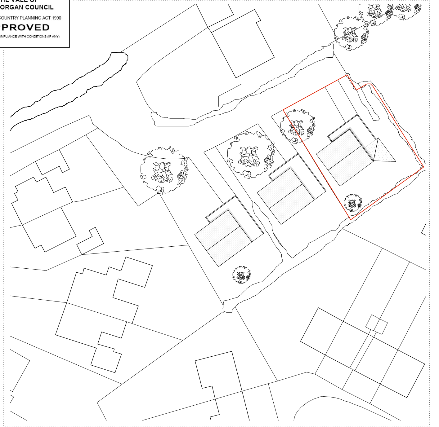
Proposed Location Plan Scale 1:500