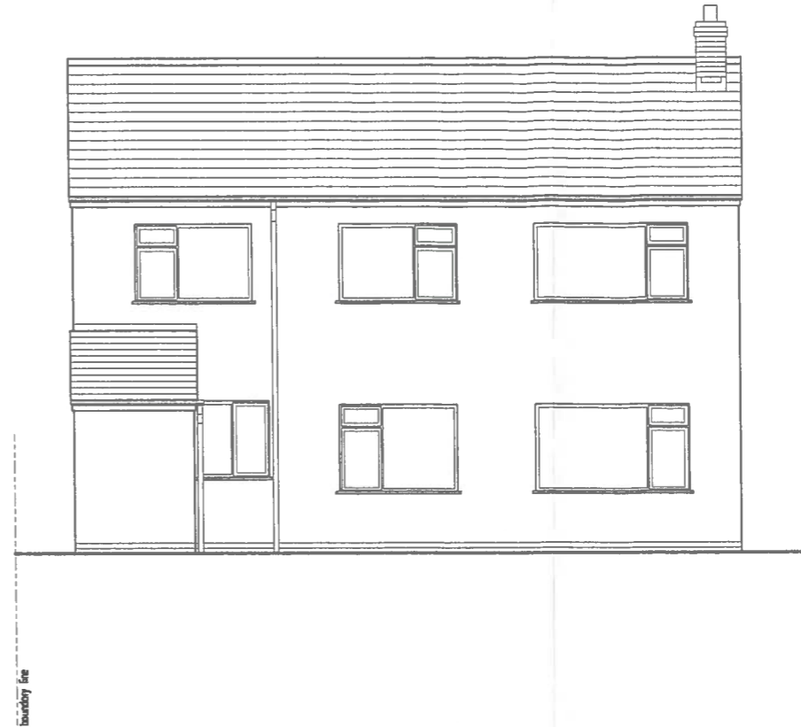
existing rear elevation