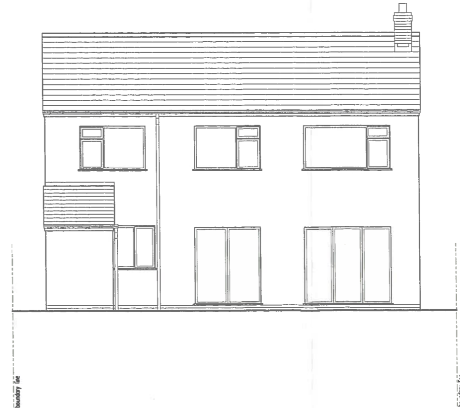
proposed rear elevation