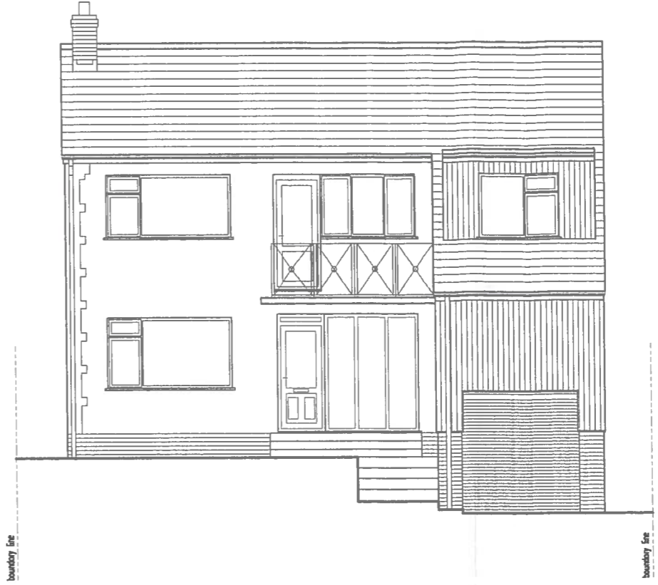
existing front elevation