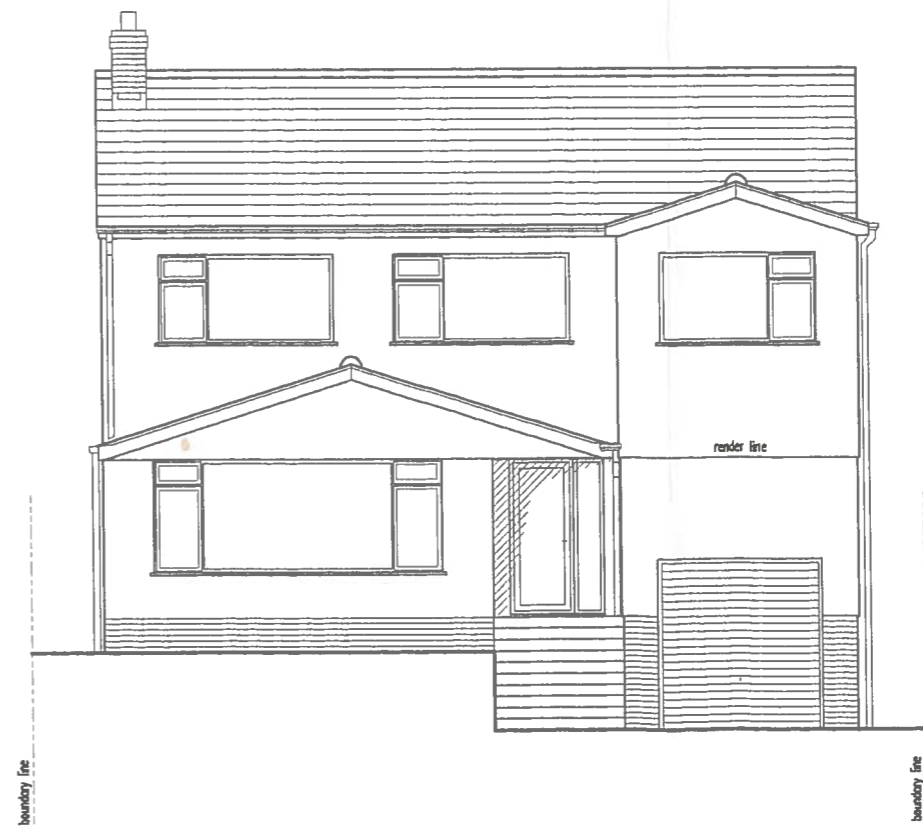
proposed front elevation