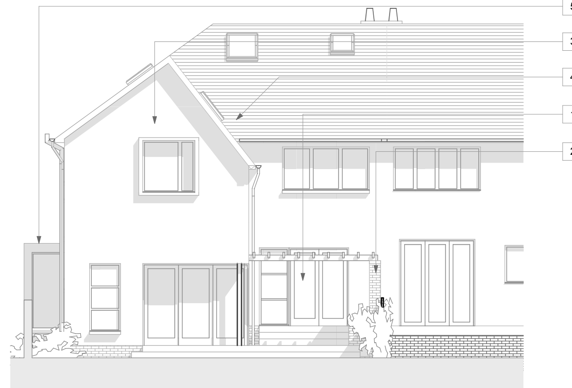
West Elevation Scale 1:100