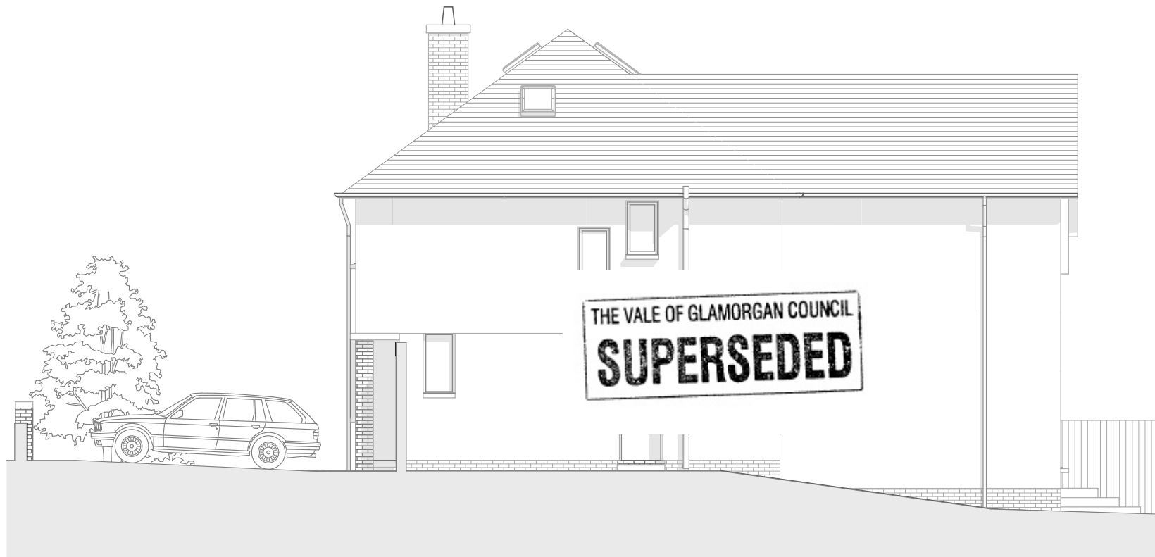
North Elevation Scale 1:100