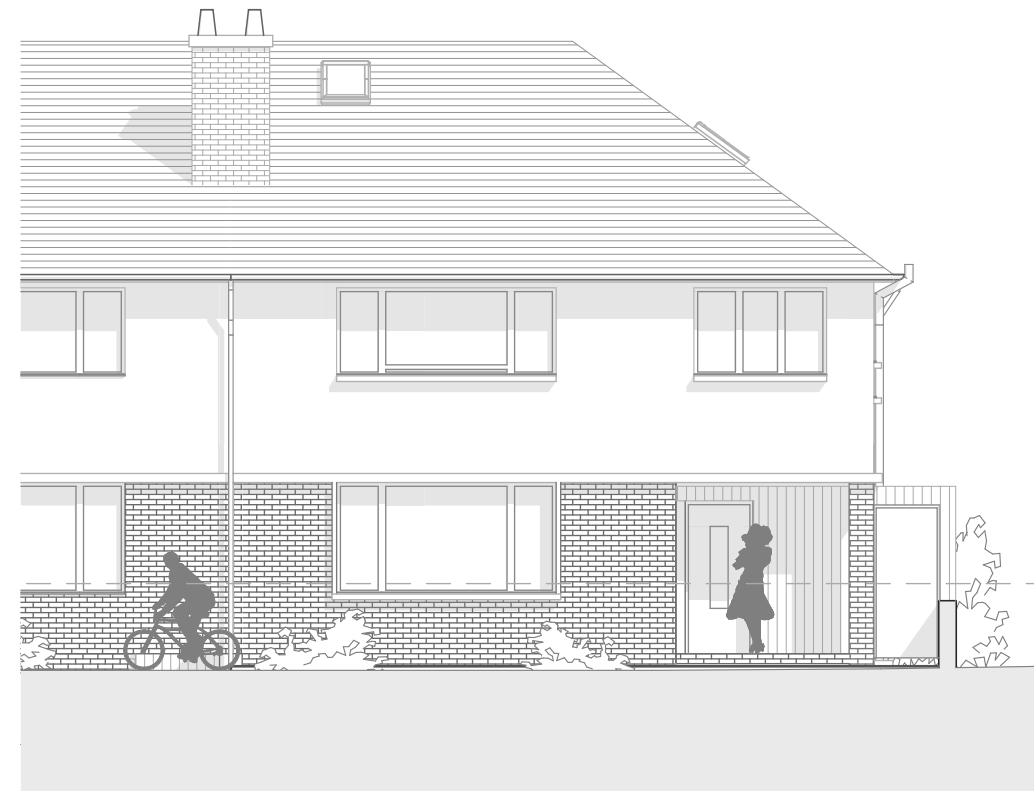
East Elevation Scale 1:100