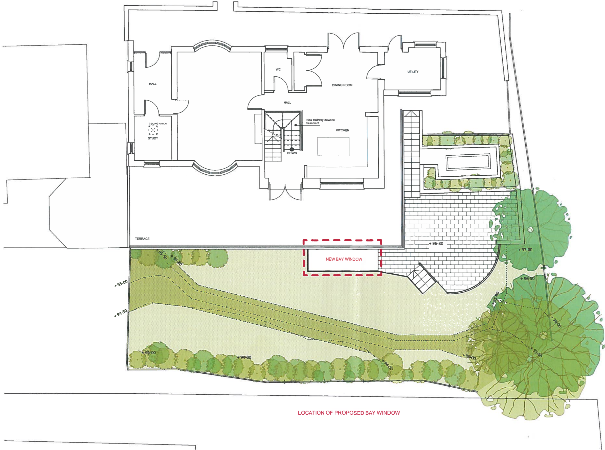
LOCATION OF PROPOSED BAY WINDOW

RECEIVED 12 MAY 2013 RECEIVED 12 FEB 2015