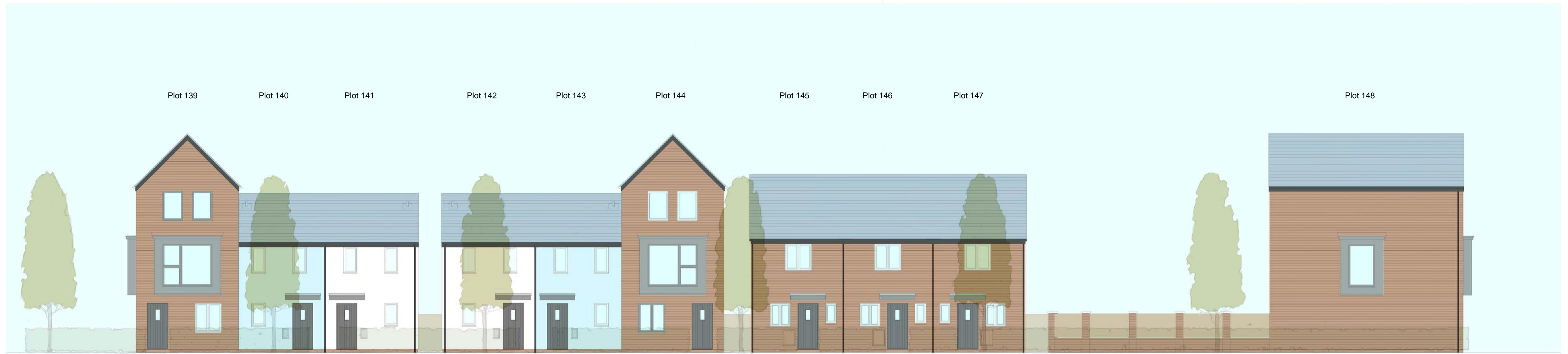
Street Scene Along Main Road