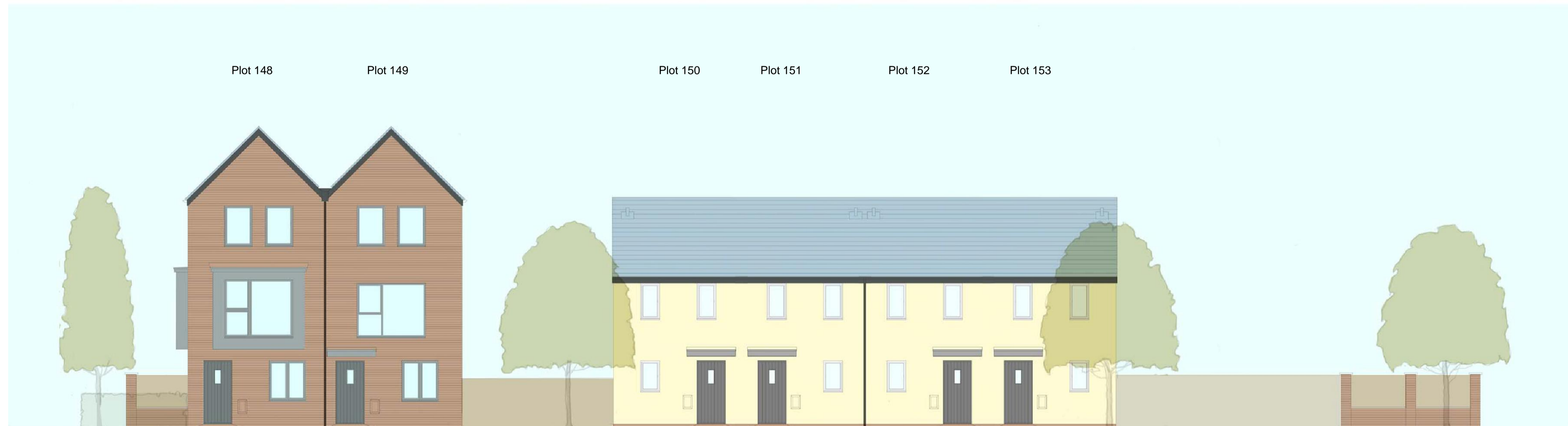
Street Scene Facing Public Open Space

Project: Westhaven AF2 Parcel Barry Waterfront