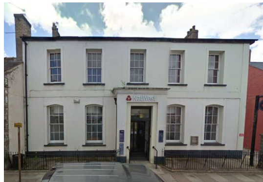
EXISTING SHOP FRONT ELEVATION