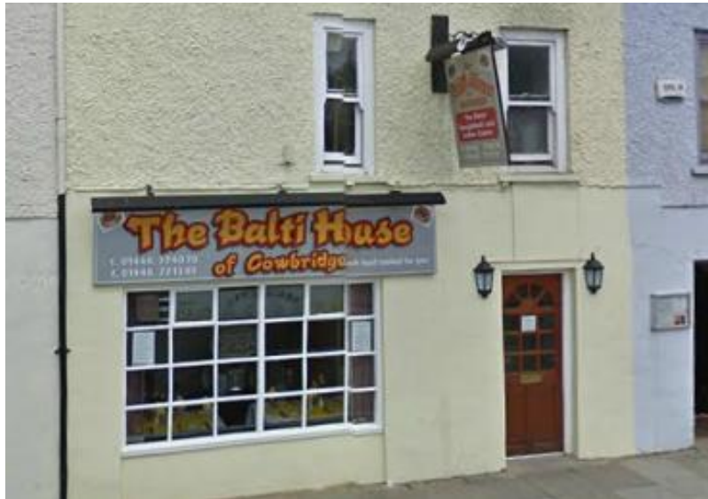
Near by shop has externally illuminated fascia and externally illuminated projecting sign.