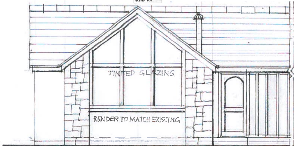
FRONT ELEVATION (SOUTH)

THE VALE OF GLAMORGAN COUNCIL TOWN AND COUNTRY PLANNING ACT 1990 APPROVED SUBJECT TO COMPLIANCE WITH CONDITIONS (IF ANY)