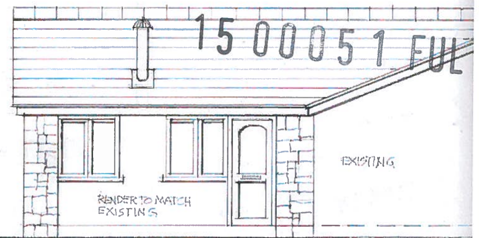
SIDE ELEVATION TO FRONT YARD (EAST)

ANDERSON AND ASSOCIATES (S. WALES) LTD. 39 HIGH STREET, COWBRIDGE, CF71 7AE TEL: 01446 772180