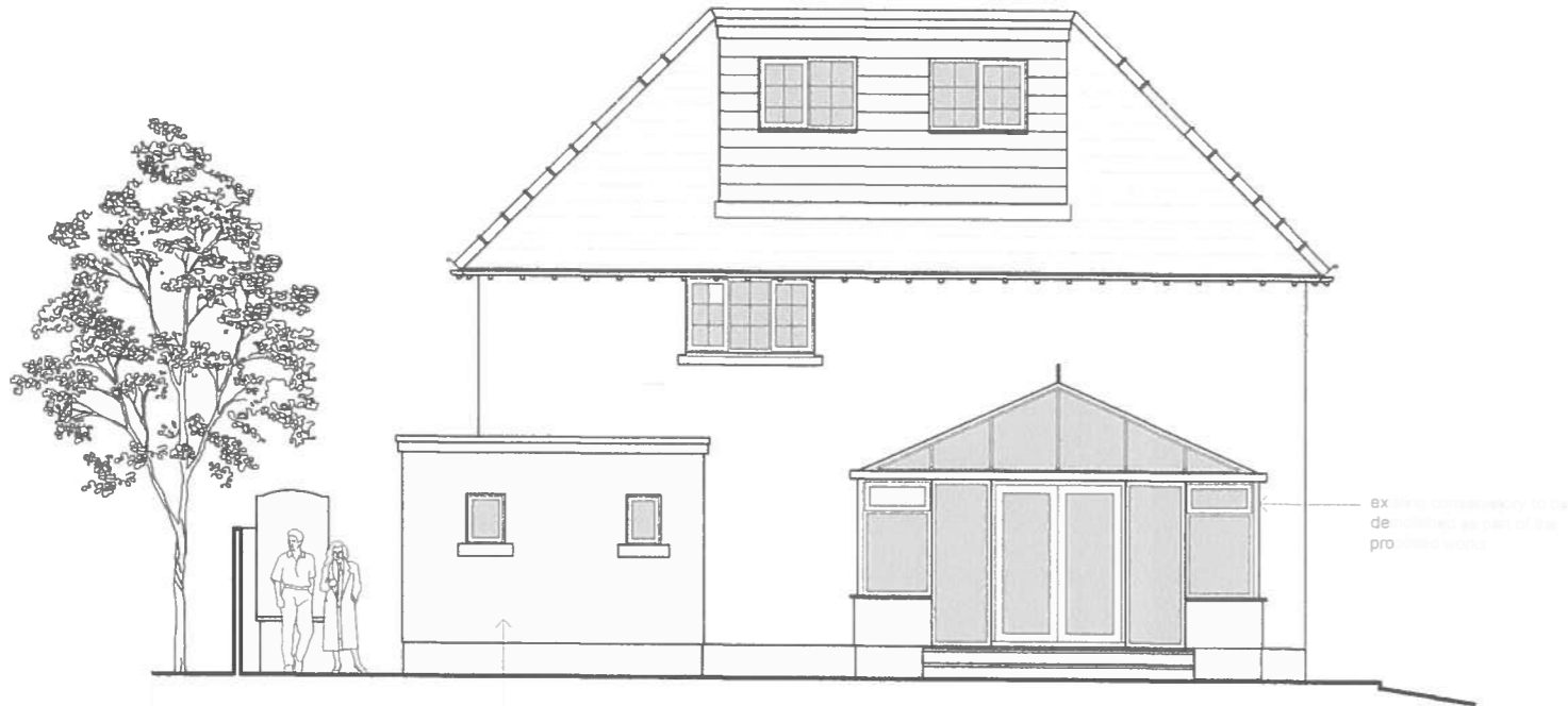
rear elevation - existing