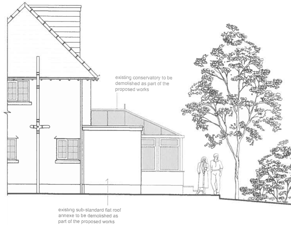
side elevation - existing