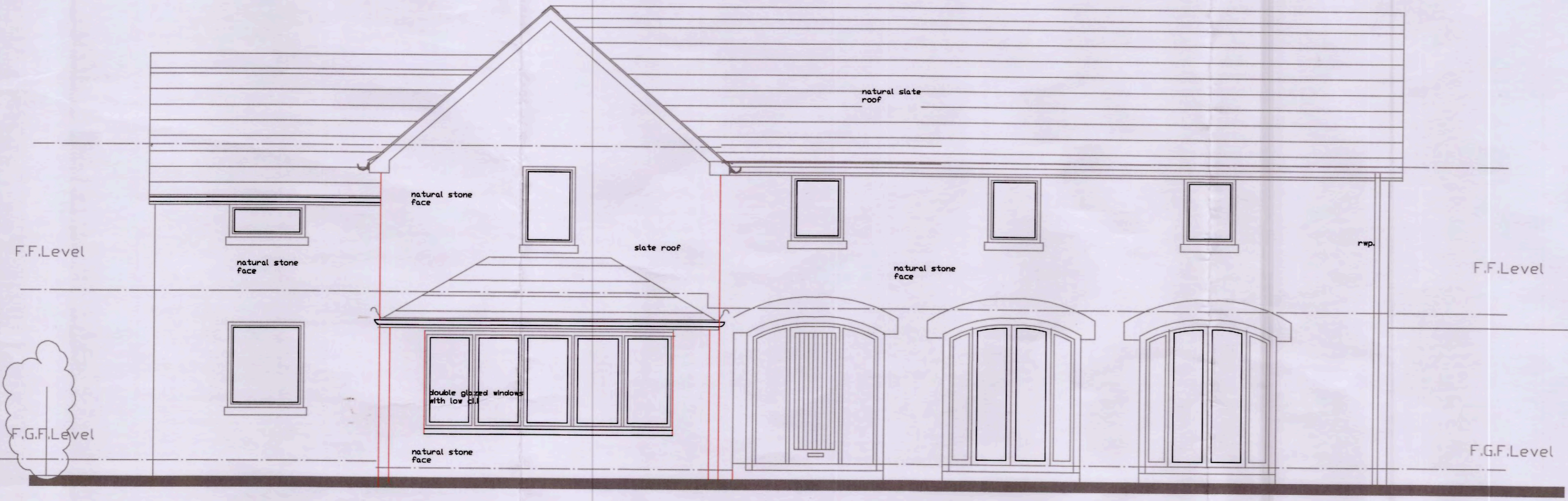
South East Elevation to Front Garden & Entrance

NOTES: This drawing is copyright. It is sent to you in confidence and must not be reproduced or disclosed to third parties without our prior permission. Do not scale from this drawing. This drawing is to be read in conjunction with all relevant consultants, specialist manufacturers drawings and specifications. Any discrepancies in dimensions or details on or between these drawings should be drawn to our attention. All dimensions are in millimetres unless noted otherwise. Any surveyed information incorporated within this drawing cannot be guaranteed as accurate unless confirmed by fixed dimension.