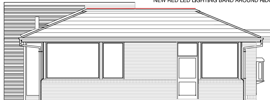
SOUTH EAST ELEVATION.

NEW RED LED LIGHTING BAND AROUND RIDGE (350c/dm2)