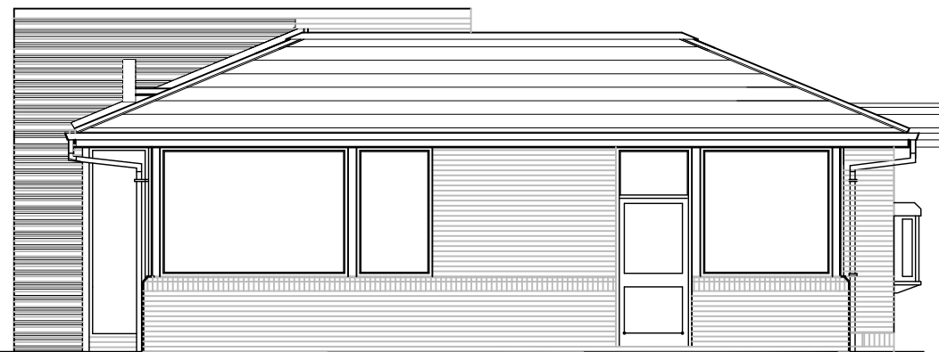
SOUTH EAST ELEVATION.